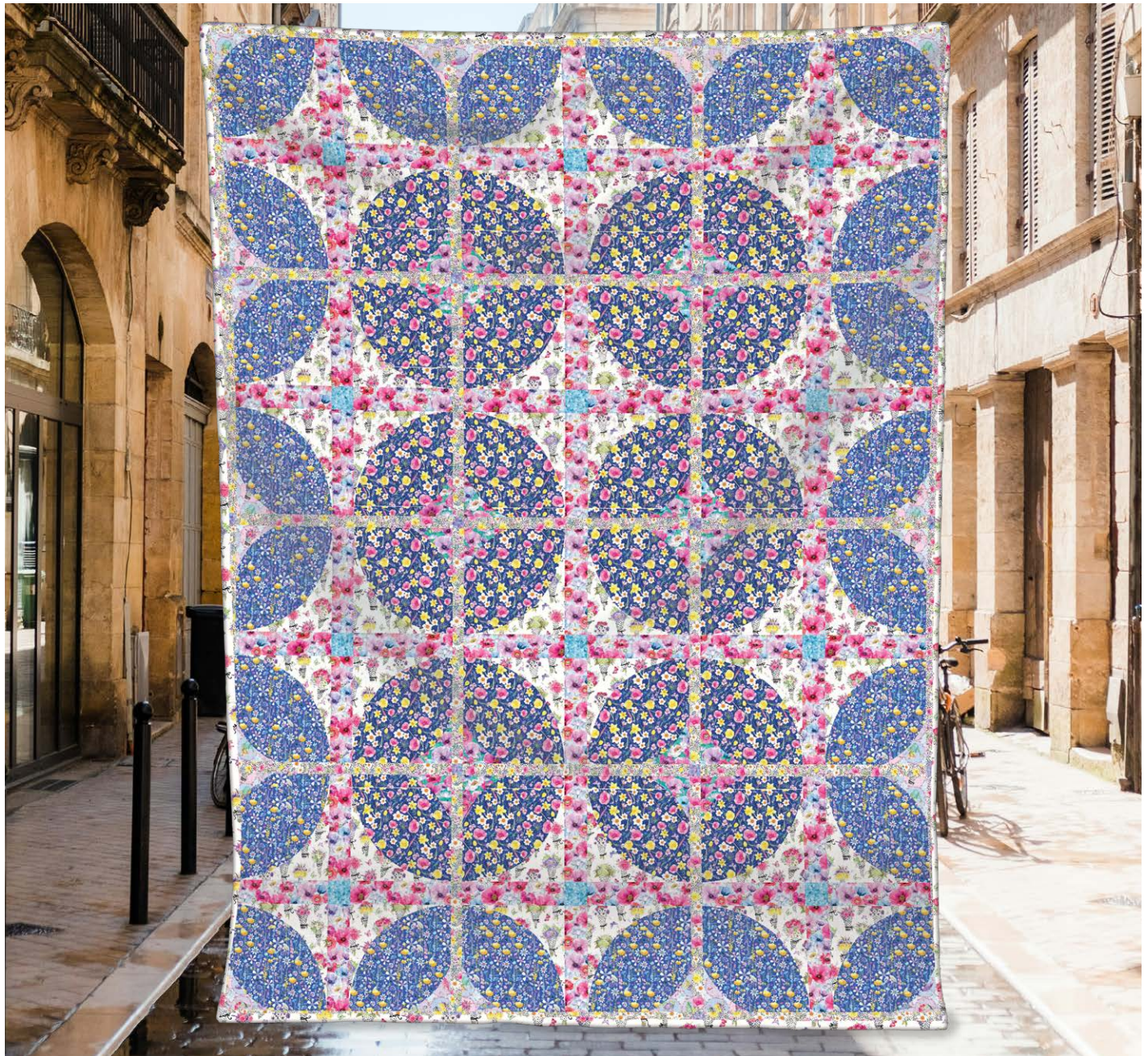
*THIS IS A DIGITAL REPRESENTATION OF THE QUILT TOP. FABRIC MAY VARY.