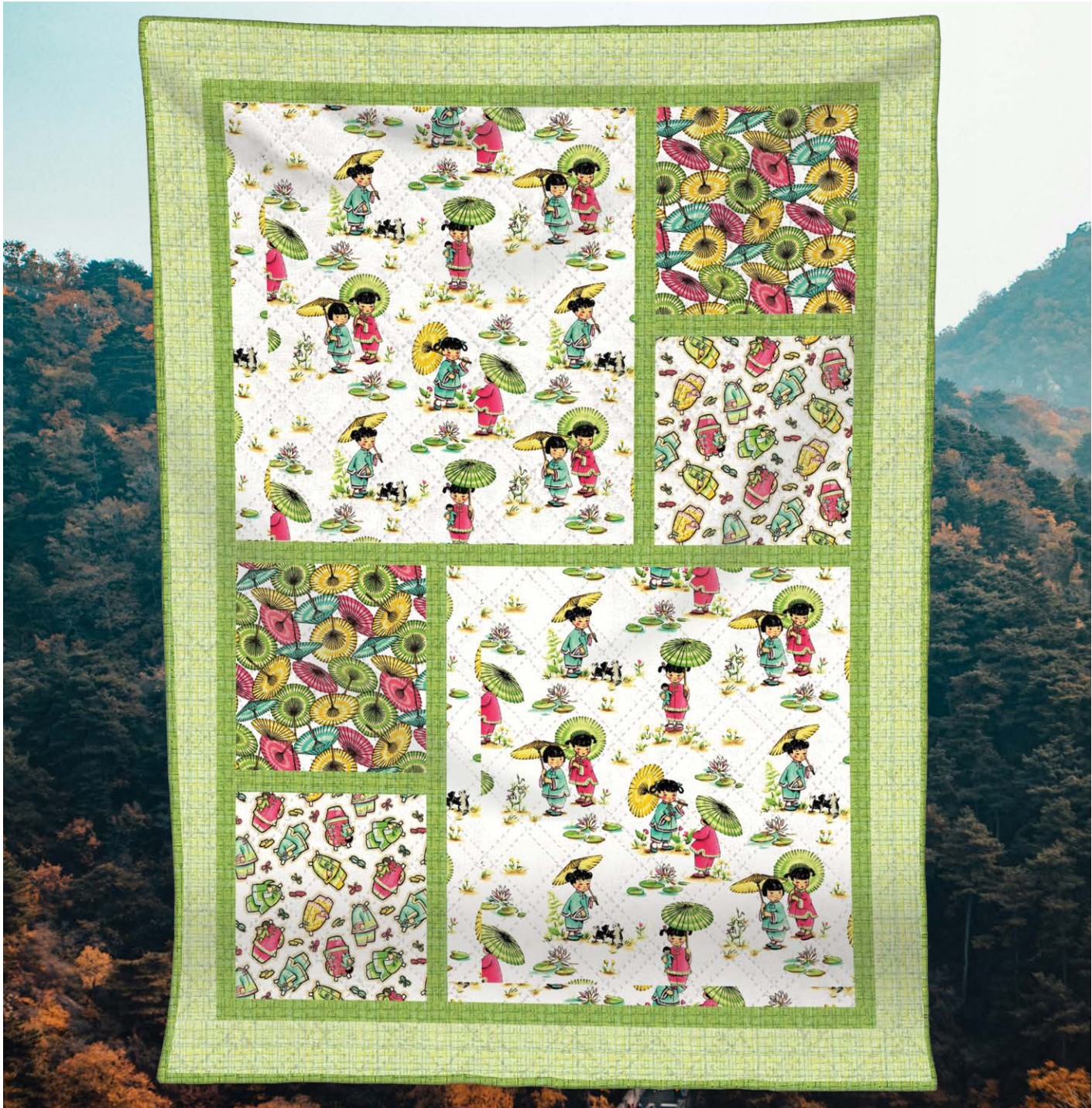
*THIS IS A DIGITAL REPRESENTATION OF THE QUILT TOP. FABRIC MAY VARY.