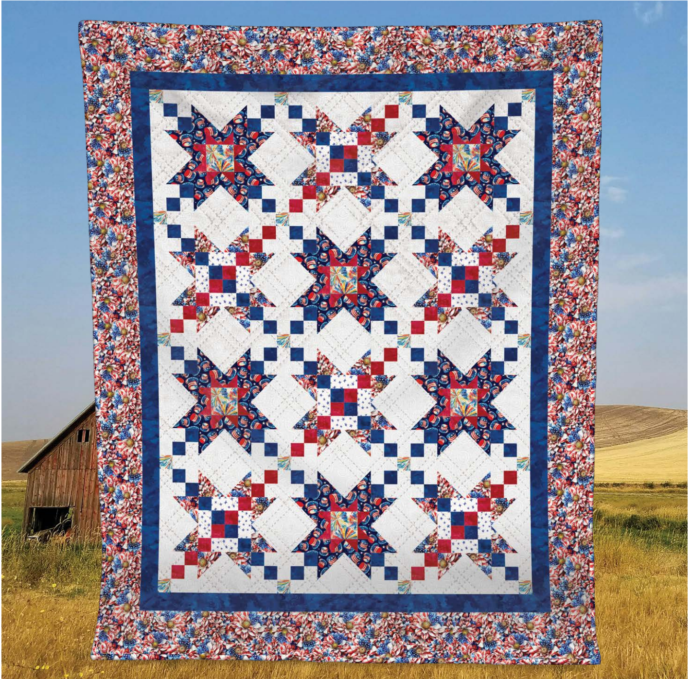
*THIS IS A DIGITAL REPRESENTATION OF THE QUILT TOP. FABRIC MAY VARY.