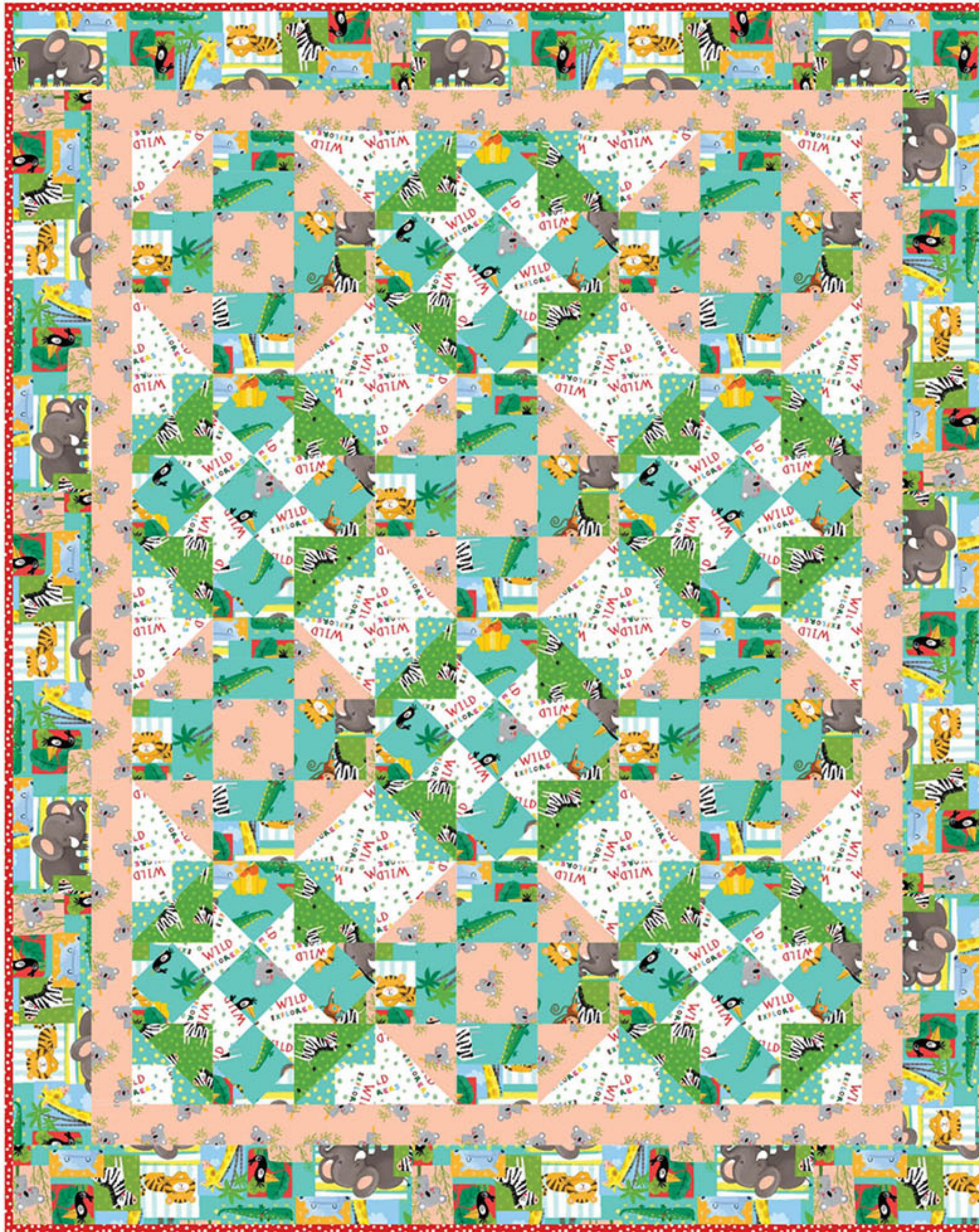
*THIS IS A DIGITAL REPRESENTATION OF THE QUILT TOP. FABRIC MAY VARY.