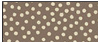
FABRIC B CX1065 taupe 1/2 yard