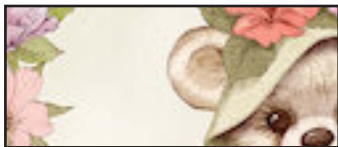
FABRIC A DDC12291 tan one full repeat

Repeat this check until your center strip measures correctly.