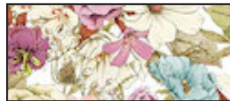
FABRIC C DDC12285 multi 1 yard