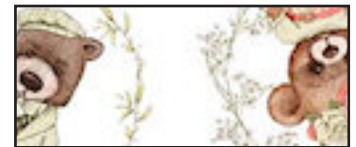
BACKING DDC12284 white 2 1/2 yards