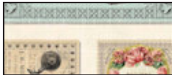
FABRIC B DCX11892 multi one full repeat