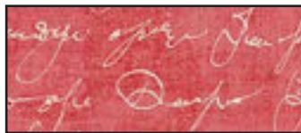
FABRIC F DCX11889 coral 3/4 yard