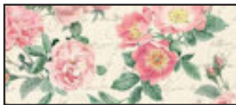
FABRIC G DCX11886 coral 3/8 yard