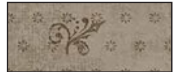
FABRIC D DCX11891 stone 7/8 yard