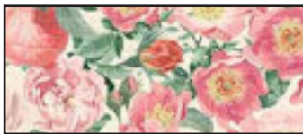
FABRIC E DCX11885 coral 5/8 yard