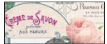
FABRIC H DCX11882 multi 1 1/4 yards