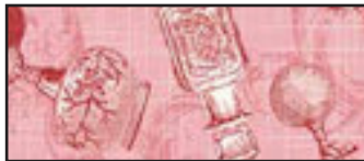
FABRIC C DCX11890 pink 7/8 yard