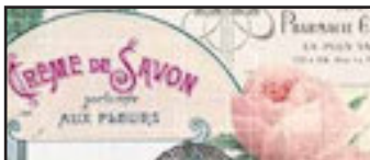
BACKING DCX11882 multi 3 1/2 yards