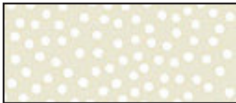
FABRIC A CX1065 parchment 1 yard

Repeat this check until your center strip measures correctly.