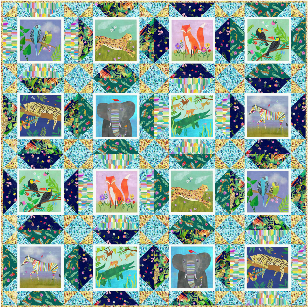
*THIS IS A DIGITAL REPRESENTATION OF THE QUILT TOP. FABRIC MAY VARY.