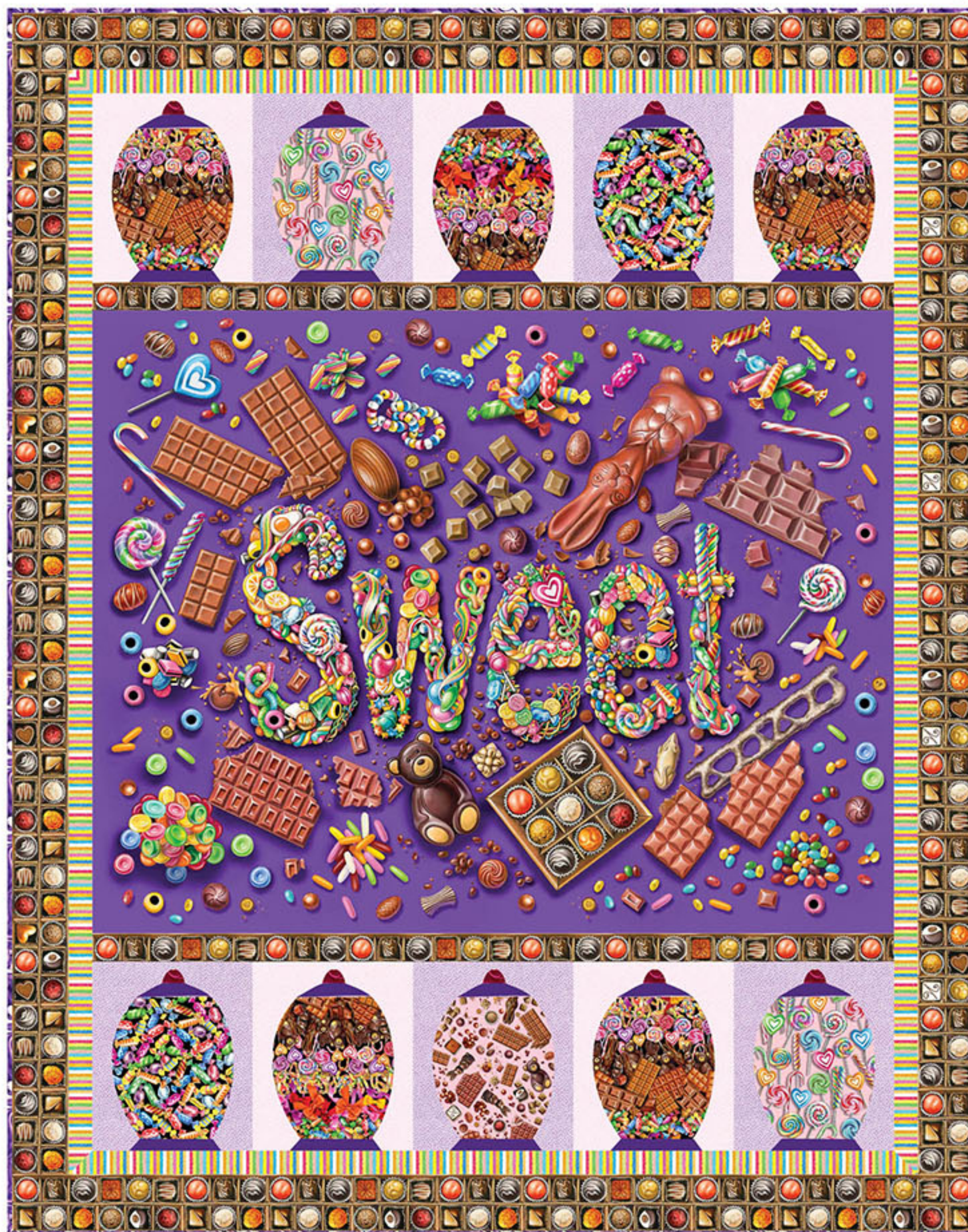
*THIS IS A DIGITAL REPRESENTATION OF THE QUILT TOP. FABRIC MAY VARY.