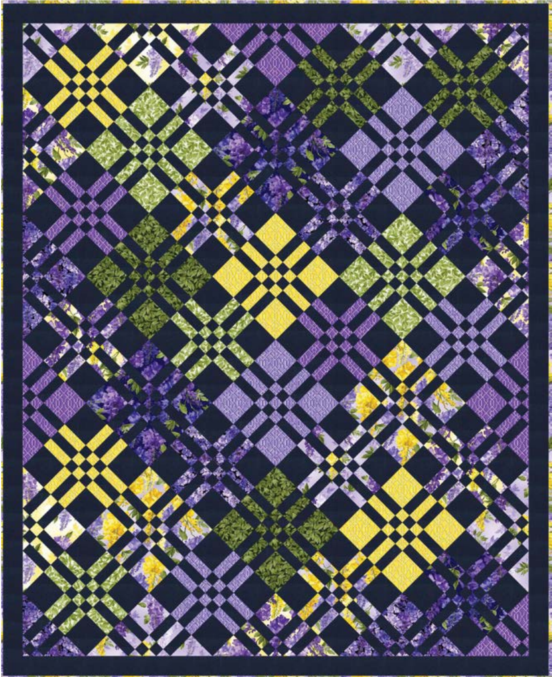
*THIS IS A DIGITAL REPRESENTATION OF THE QUILT TOP. FABRIC MAY VARY.

SIZE: 55 1/2"W X 68"H | LEVEL: INTERMEDIATE | PATTERN BY: CHERYL BRICKEY OF MEADOW MIST DESIGNS COMMERCIAL PATTERN AVAILABLE AT WWW.MEADOWMISTDESIGNS.COM , CHECKER DISTRIBUTORS & BREWER