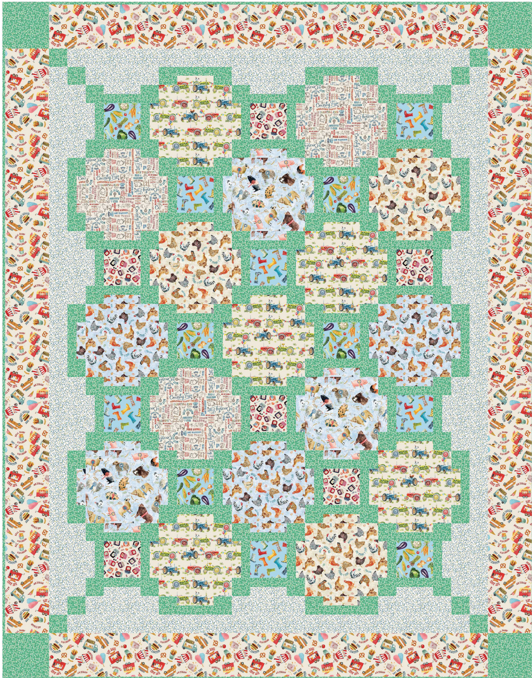
*THIS IS A DIGITAL REPRESENTATION OF THE QUILT TOP. FABRIC MAY VARY.

SIZE: 72"W X 92"H | LEVEL: CONFIDENT BEGINNER | PATTERN BY: SWIRLY GIRLS DESIGN COMMERCIAL PATTERN AVAILABLE AT WWW.SWIRLYGIRLSDESIGN.COM & CHECKER DISTRIBUTORS