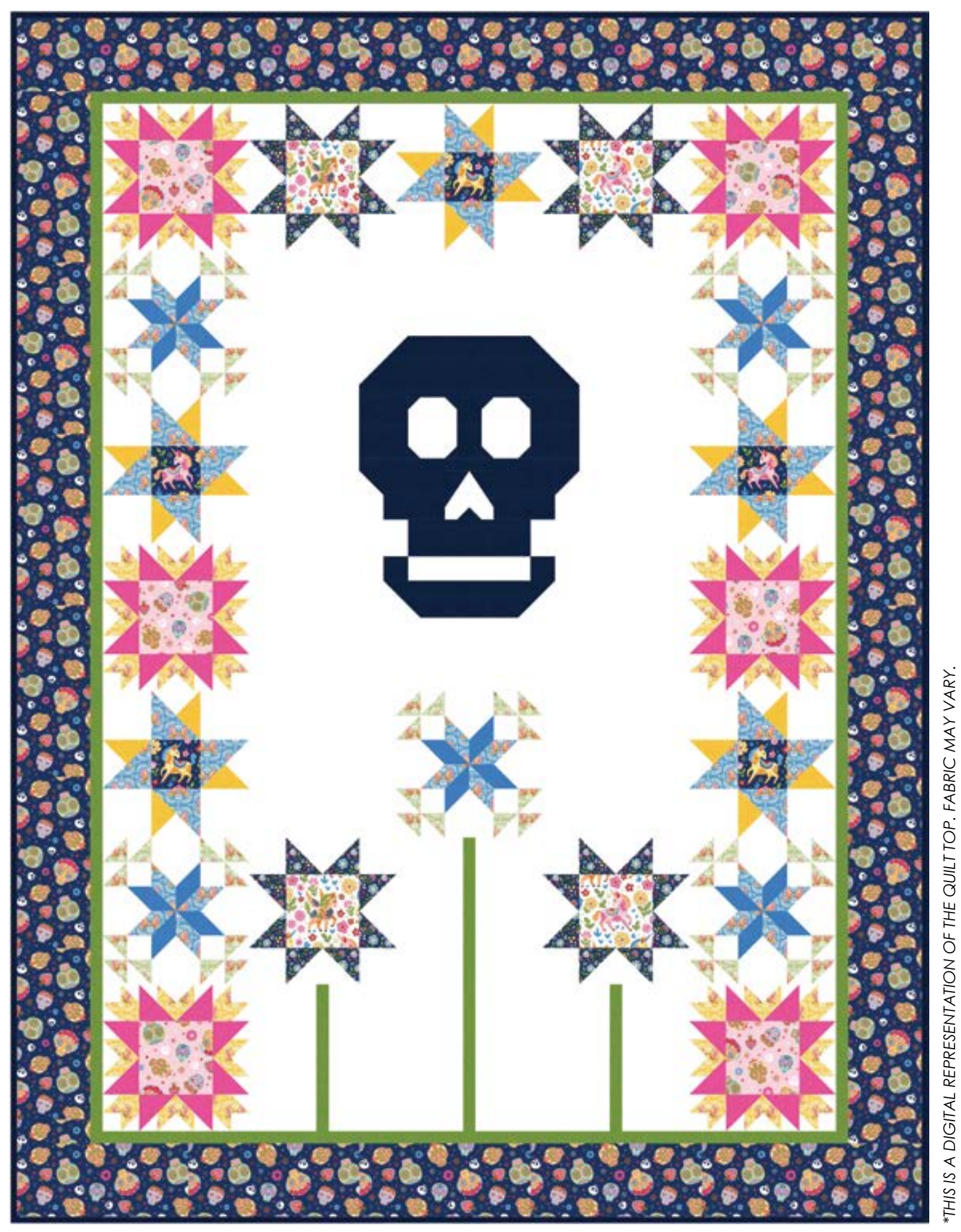
FREE PATTERN AVAILABLE AT WWW.MISSWINNIE.CA