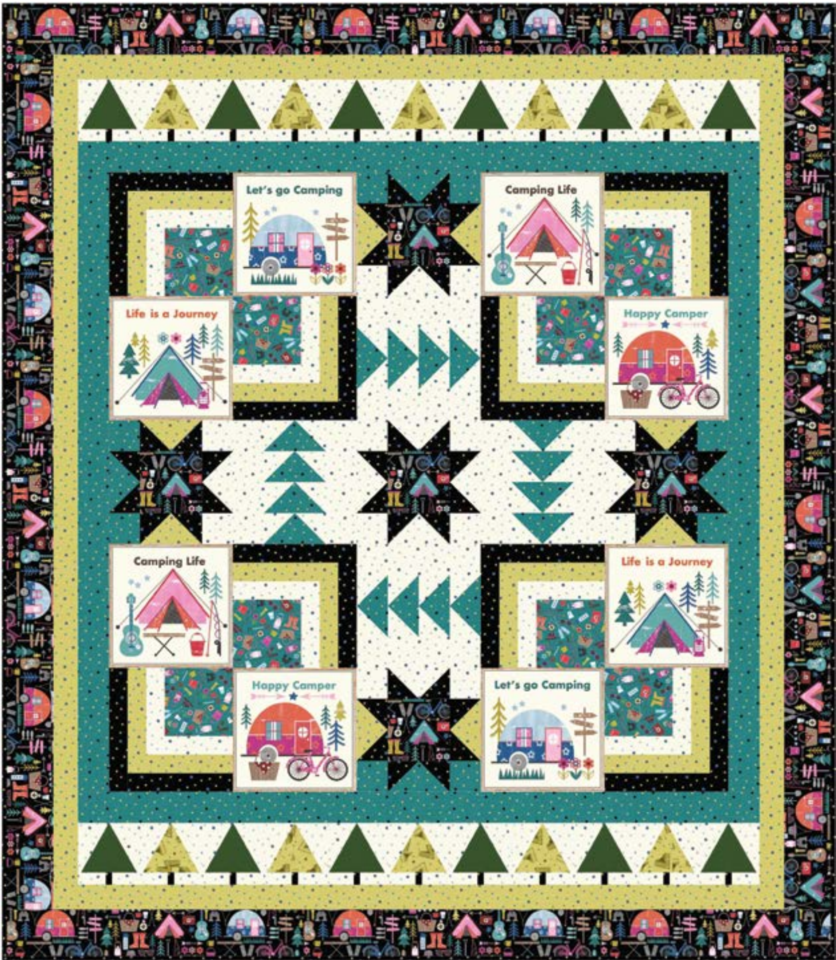
*THIS IS A DIGITAL REPRESENTATION OF THE QUILT TOP. FABRIC MAY VARY.

COMMERCIAL PATTERN AVAILABLE AT WWW.FABRICADDICT.NET OR CHECKER DISTRIBUTORS