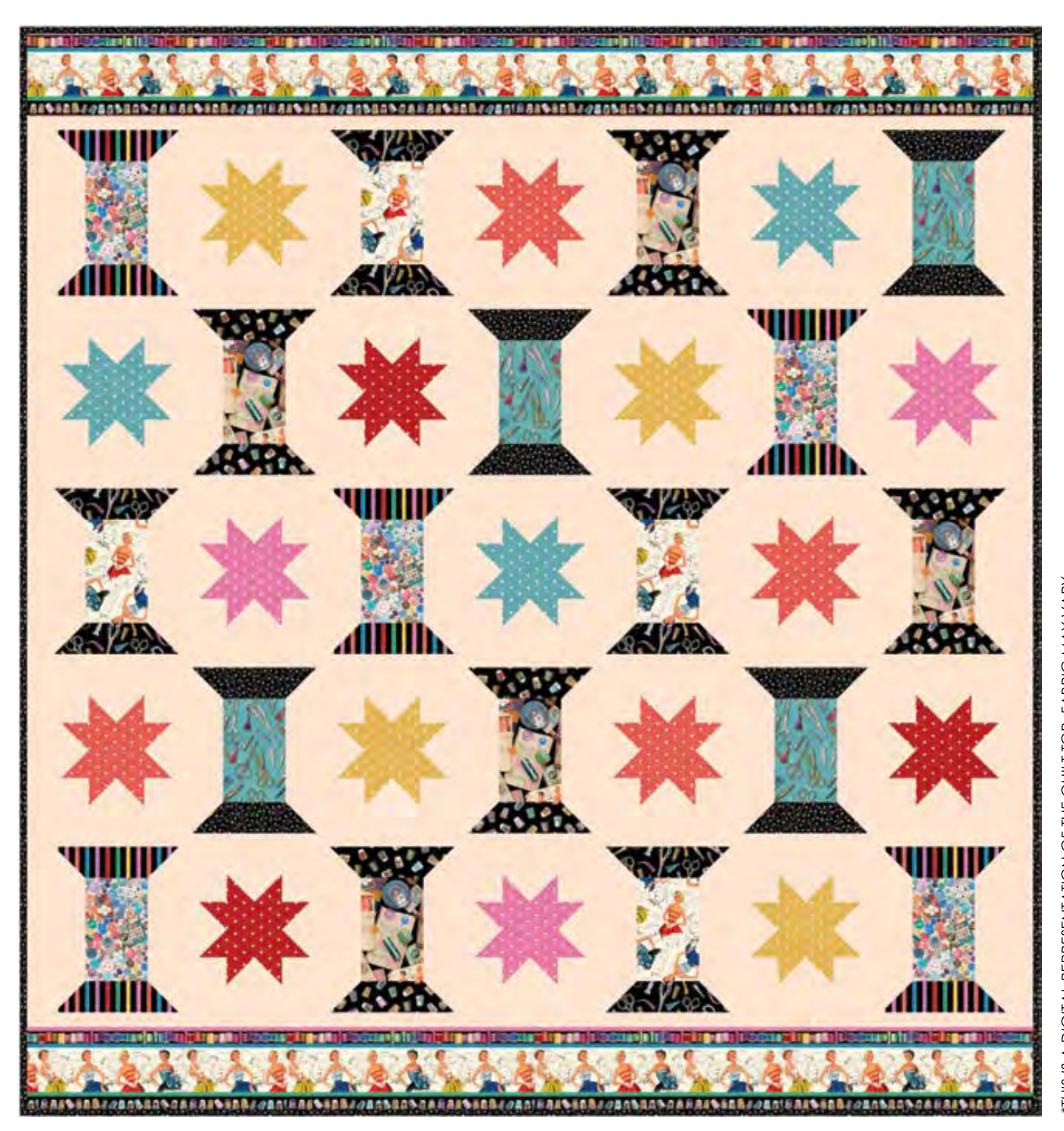
FREE PATTERN AVAILABLE AT WWW.MICHAELMILLERFABRICS.COM