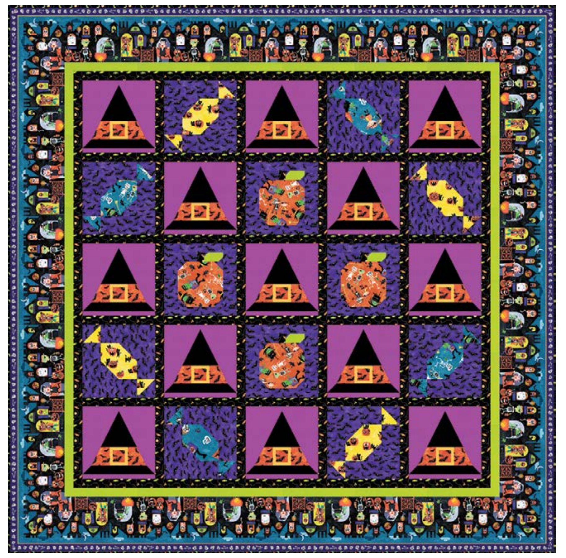
COMMERCIAL PATTERN AVAILABLE AT WWW.THEWHIMSICALWORKSHOP.COM OR CHECKER DISTRIBUTORS