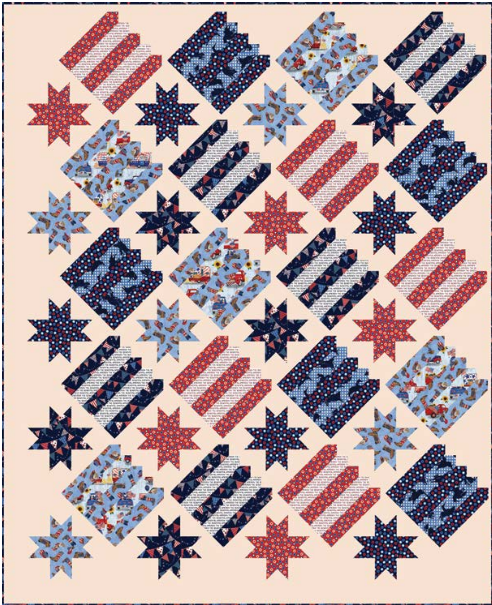
*THIS IS A DIGITAL REPRESENTATION OF THE QUILT TOP. FABRIC MAY VARY.

SIZE: 67"W X 81"H | LEVEL: CONFIDENT BEGINNER | PATTERN BY: EVERYDAY STITCHES