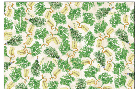
CX10871-CREAM 2/3 YARD *BACKING*