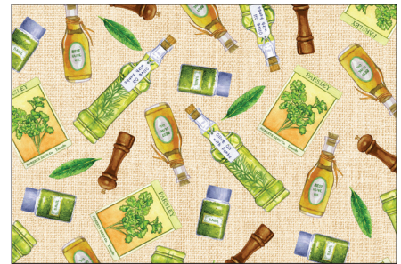
CX10869-BEIGE 1/3 YARD