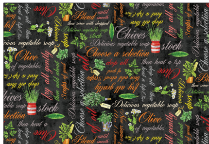
CX10873-CHARCOAL 1/3 YARD