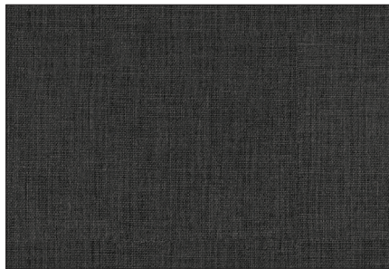
CX10875-CHARCOAL 1/3 YARD