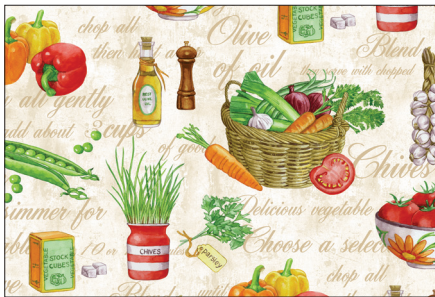
DCX10866-CREAM 1/3 YARD

COMMERCIAL PATTERN : WWW.FABRICADDICT.NET & CHECKER DISTRIBUTORS