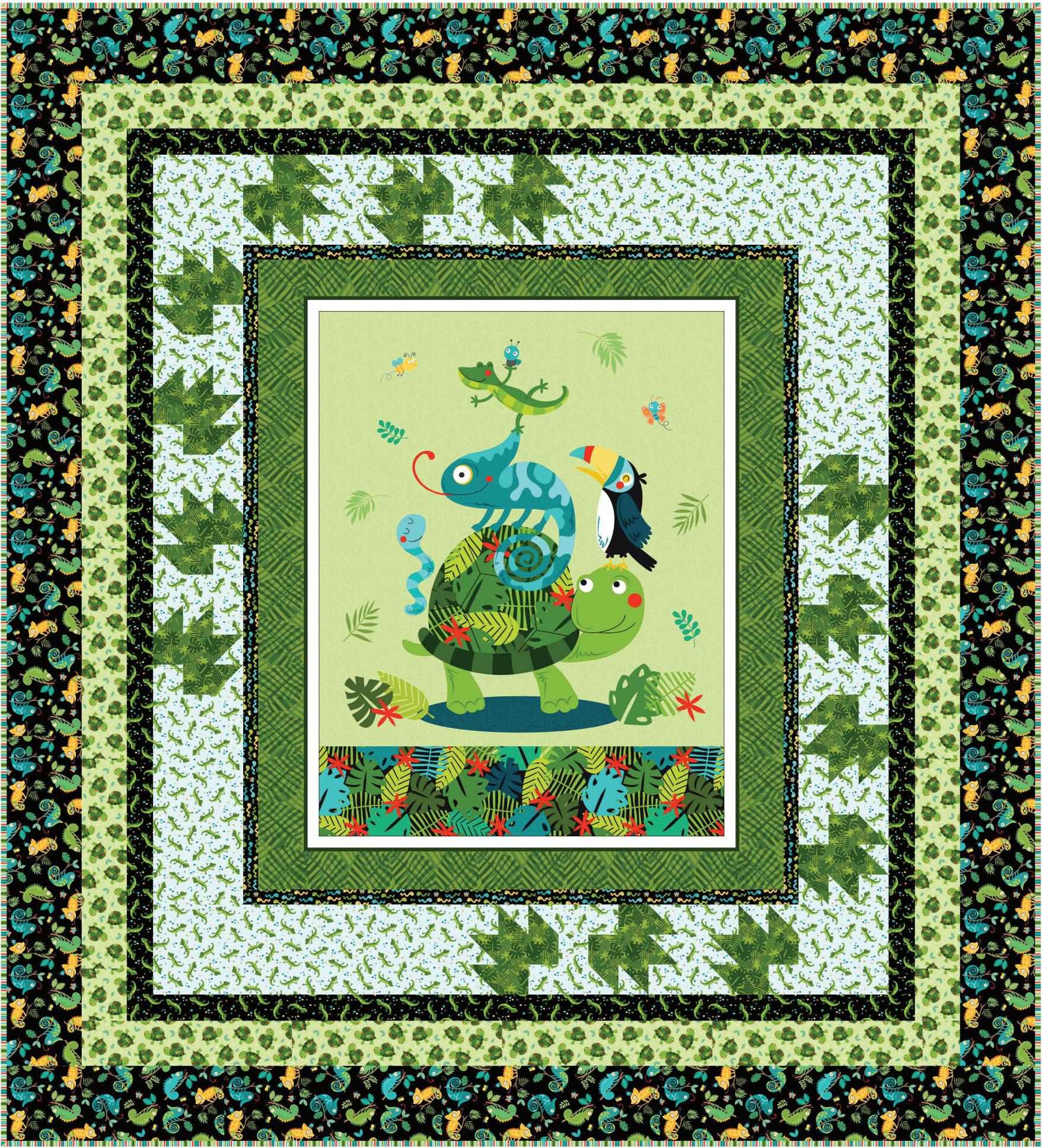
*THIS IS A DIGITAL REPRESENTATION OF THE QUILT TOP. FABRIC MAY VARY.

SIZE: 69”W X 76”H | LEVEL: EASY | PATTERN BY: THE FABRIC ADDICT