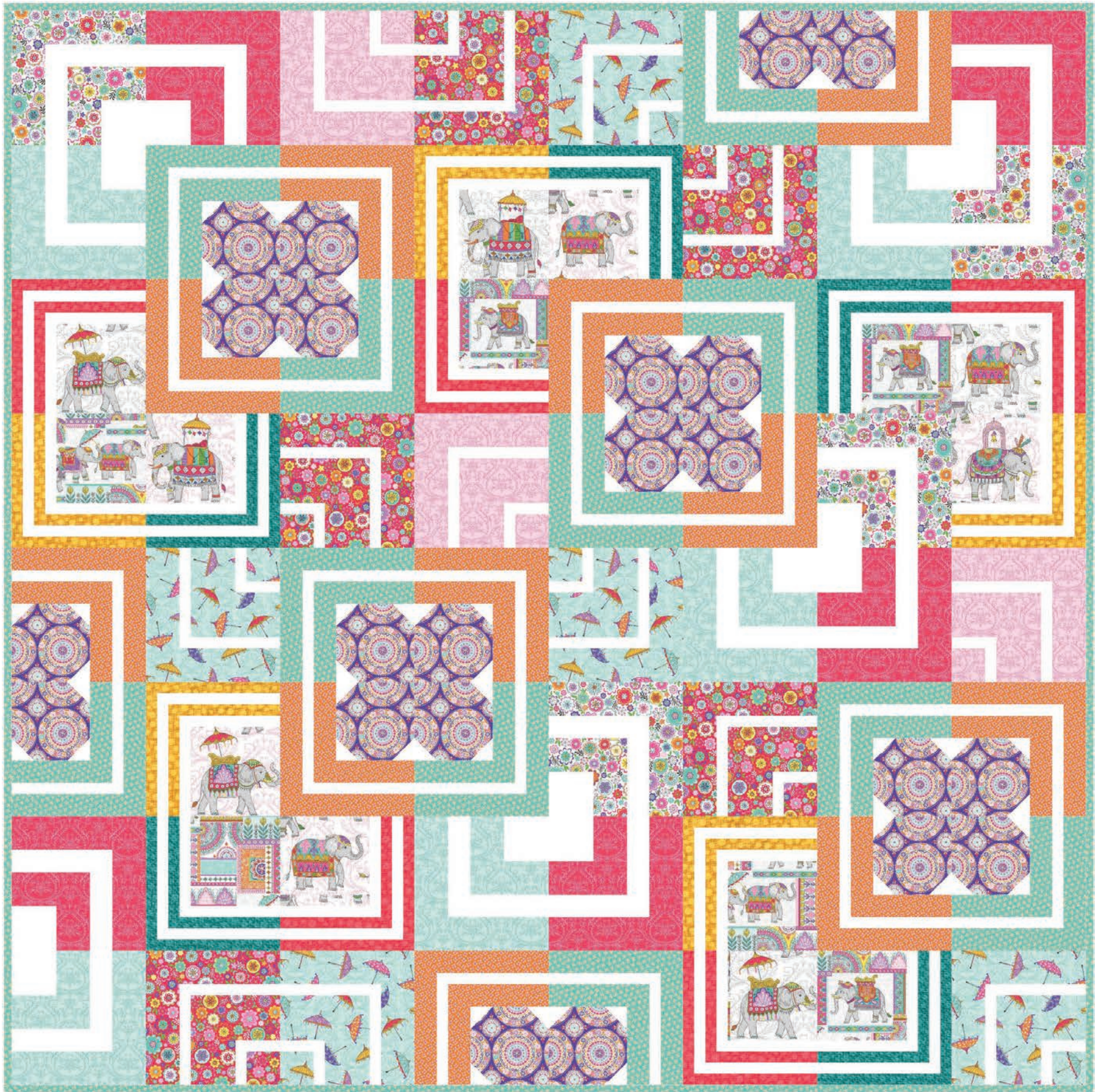
*THIS IS A DIGITAL REPRESENTATION OF THE QUILT TOP. FABRIC MAY VARY.

SIZE: 72”W X 72”H | LEVEL: INTERMEDIATE | PATTERN BY: NATALIE CRABTREE