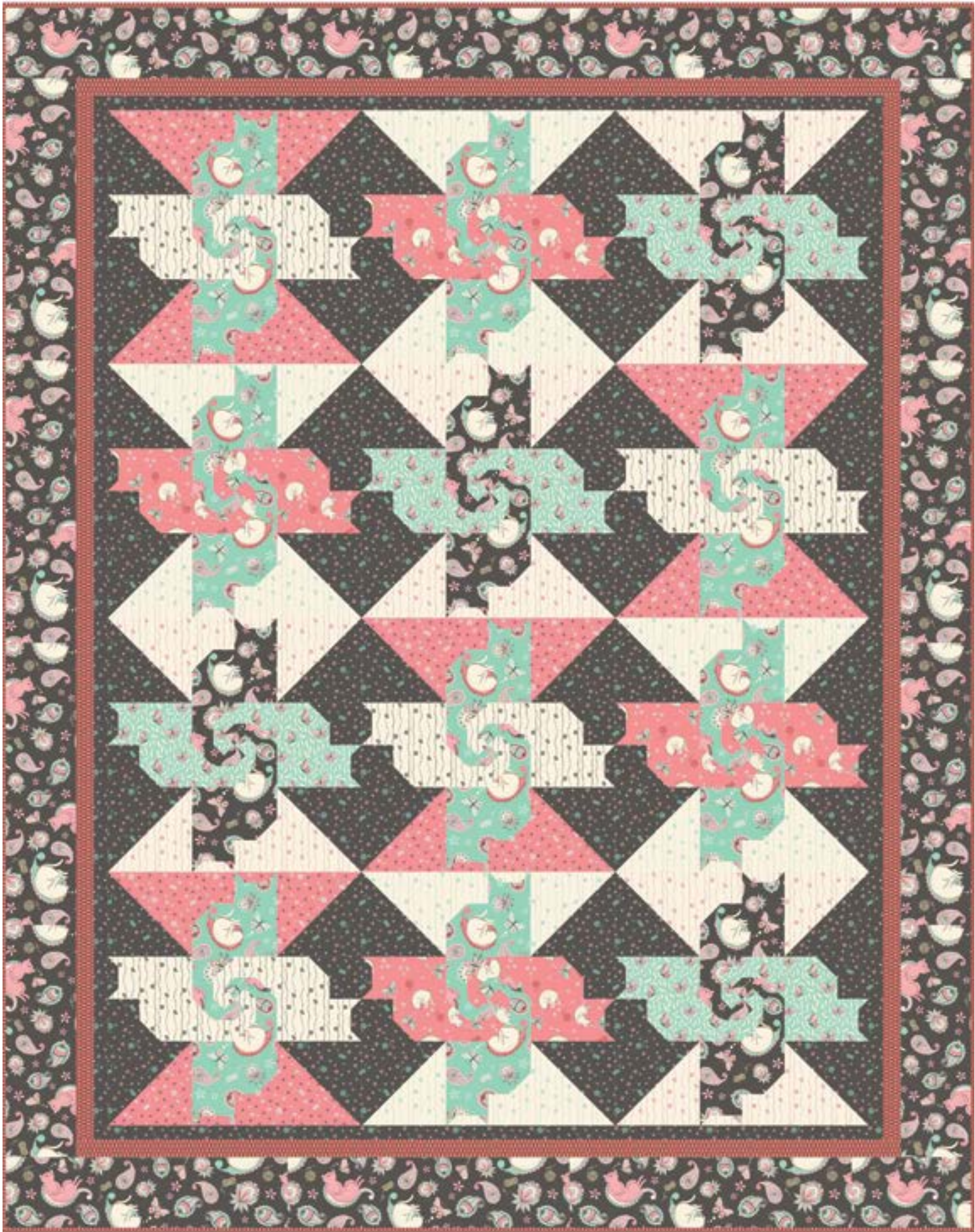
*THIS IS A DIGITAL REPRESENTATION OF THE QUILT TOP. FABRIC MAY VARY.

SIZE: 69”W X 87”H | LEVEL: CONFIDENT BEGINNER | PATTERN BY: THE FABRIC ADDICT