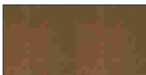
FABRIC F SMS7580 Brown 1-1/2 yards (includes binding)