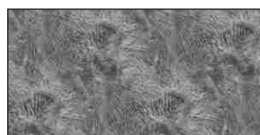
FABRIC C SMP9301 Gray 1/4 yard