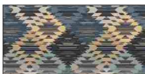
FABRIC B SMP9297 Blue 1/4 yard