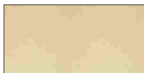
FABRIC E SMS7580 Camel 3/4 yard