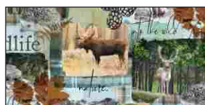
FABRIC A SMP9294 Multi 1-3/4 yards