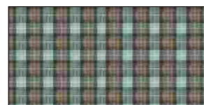
FABRIC D SMP9302 Blue 1/4 yard