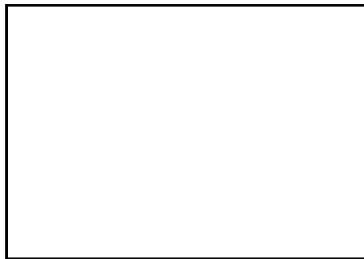
(BACKING) YOUR CHOICE 3-1/2 YARDS