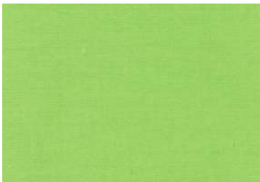
FABRIC B SC5333-FERN COTTON COUTURE 3/8 YARD