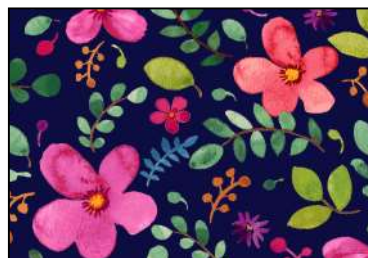
FABRIC E CX9259-NAVY BRILLIANT BLOSSOM 5/8 YARD