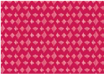
FABRIC J CX9263-RED KIMONO 1/4 YARD