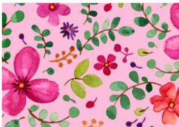
FABRIC F CX9259-PINK BRILLIANT BLOSSOM 3/8 YARD