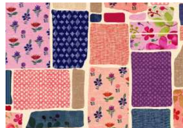
FABRIC D CX9258-MULTI PATCHWORK DELIGHT 5/8 YARD