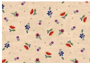
FABRIC G CX9261-BEIGE PETITE BEAUTY 3/8 YARD