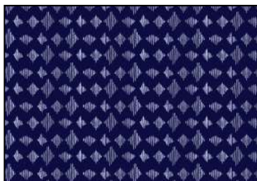
FABRIC I CX9263-NAVY KIMONO 5/8 YARD* (INCLUDES BINDING)