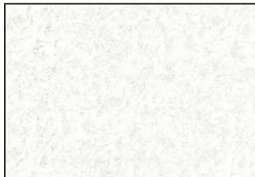
FABRIC A CM0376-GLIMMER FAIRY FROST 1-3/8 YARDS

WE DO OUR BEST TO MAKE SURE THESE ARE ACCURATE YARDAGES BUT THESE ARE ESTIMATES UNTIL THE FINAL PATTERN IS COMPLETED AND EDITED. THANK YOU.