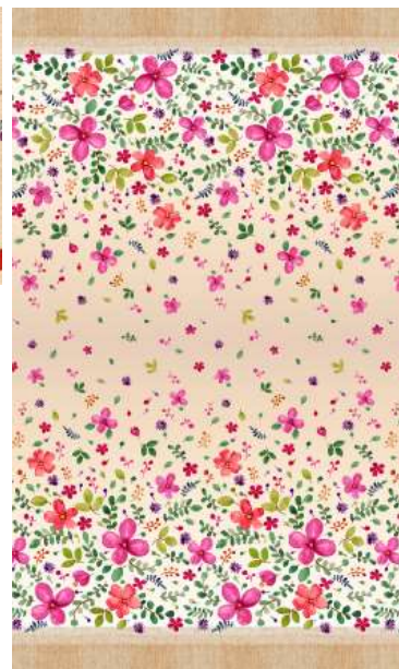
FABRIC H CX9262-BEIGE DOUBLE HAPPINESS 3/8 YARD