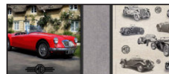
FABRIC D DDC9152 taupe one full repeat