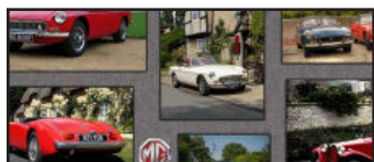
FABRIC E DDC9149 taupe 3/4 yard