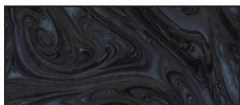
FABRIC A CX1087 graphite 1 1/2 yards

PLEASE READ THROUGH ENTIRE PATTERN BEFORE BEGINNING