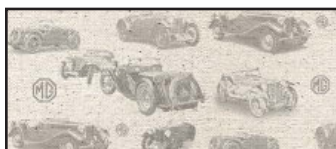
FABRIC B DDC9151 cream 1 3/8 yards