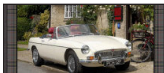
FABRIC C DDC9148 taupe one full repeat