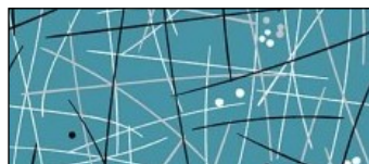
FABRIC C CX8713 BLUE 1/4 YD