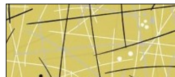
FABRIC D CX8713 OLIVE 1/4 YD