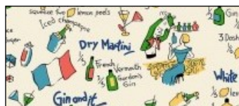
FABRIC G CX8716 CREAM 5/8 YD