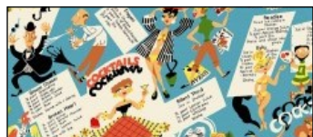
FABRIC A CX4414 BLUE FQ