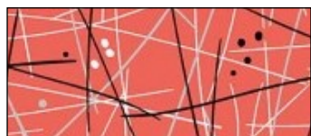
FABRIC E CX8713 RED 1/2 YD