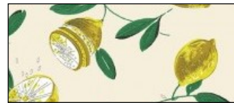
FABRIC H CX8718 CREAM 1/2 YD

BATTING: 21" X 57" BACKING: 1 YD (pieced)