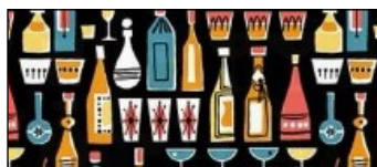
FABRIC F CX8714 BLACK 1/8 YD