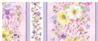
FABRIC G DCX8908-PINK DORSET 1-5/8 YARDS