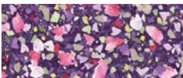
FABRIC F CX8911-GRAPE BEDROCK 5/8 YARD