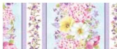
FABRIC G DCX8908-BREEZE DORSET 1-5/8 YARDS