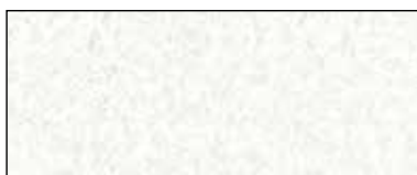
FABRIC H CM0376-GLIMMER FAIRY FROST 1-1/2 YARDS