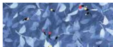
FABRIC D CX8904-DENIM WILD MEADOWS 3/8 YARD