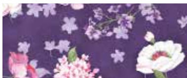
FABRIC B CX8903-GRAPE GARDEN VARIETY 7/8 YARD