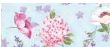
FABRIC C CX8903-BREEZE GARDEN VARIETY 5/8 YARD