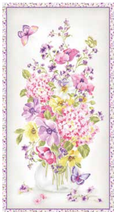
FABRIC A DCX8910-BRIGHT WHITE FLOWER BOUQUET 1 REPEAT OR 2/3 YARD