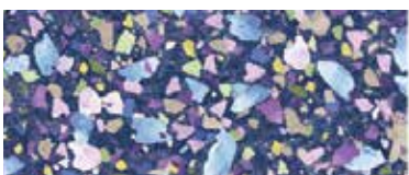
FABRIC F CX8911-DENIM BEDROCK 5/8 YARD