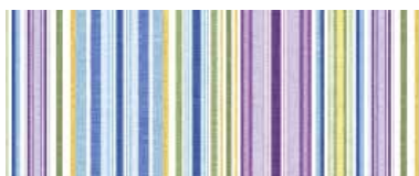
FABRIC E CX8909-DENIM LAWN STRIPE 7/8 YARD