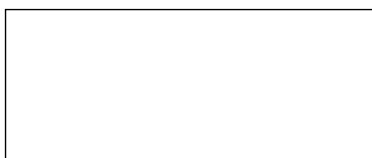
(BACKING) YOUR CHOICE 4-1/2 YARDS