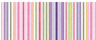
FABRIC E CX8909-PINK LAWN STRIPE 7/8 YARD