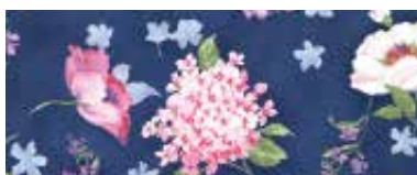
FABRIC B CX8903-DENIM GARDEN VARIETY 7/8 YARD