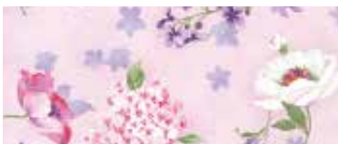
FABRIC C CX8903-PINK GARDEN VARIETY 5/8 YARD