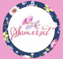
BLUE COLORWAY QUILT:

SIZE: 52"Wx 72"H • LEVEL: CONFIDENT BEGINNER • PATTERN BY: WENDY SHEPPARD FABRIC COLLECTION: SOMERSET • FREE PATTERN AVAILABLE ON: MICHAELMILLERFABRICS.COM