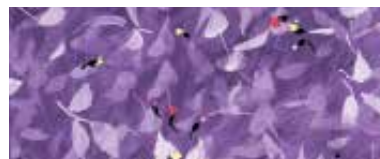
FABRIC D CX8904-GRAPE WILD MEADOWS 3/8 YARD