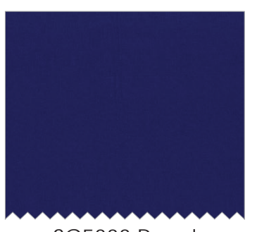
SC5333 Royal Cotton Couture 1 1/8 yards