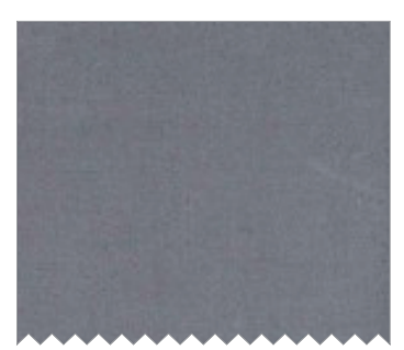
SC5333 Clay Cotton Couture 3/4 yard