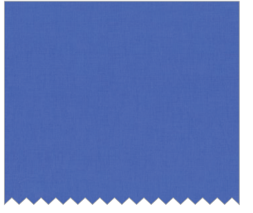
SC5333 Sailor Cotton Couture 1 yard