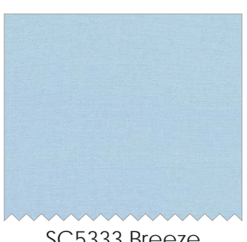
SC5333 Breeze Cotton Couture 3/4 yard