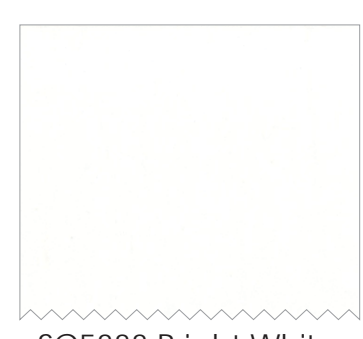
SC5333 Bright White Cotton Couture 1 1/3 yards