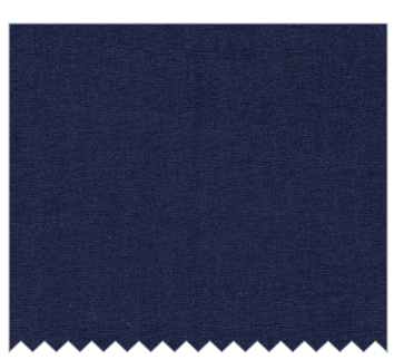
SC5333 Midnight Cotton Couture 1 1/8 yards