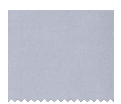
SC5333 Ozone Cotton Couture 1/4 yard