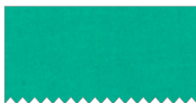
SC5333 Lillypad Fat 1/8