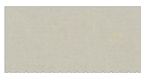
SC5333 Linen Fat 1/4