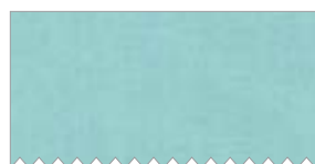
SC5333 Glass Fat 1/4