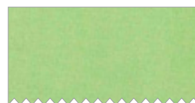
SC5333 Celery Fat 1/8