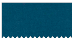
SC5333 Celestial 7" Square