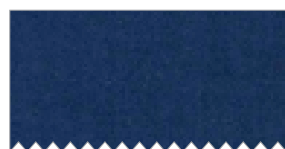
SC5333 Cadet 7" Square