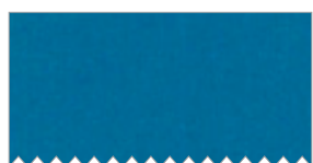
SC5333 Peacock Fat 1/8