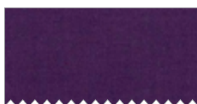
SC5333 Jam Fat 1/8