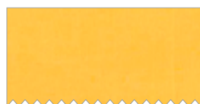
SC5333 Marigold 1/6 yard