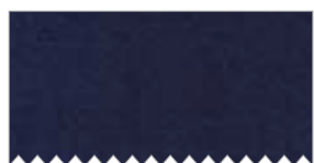
SC5333 Ink 7" Square