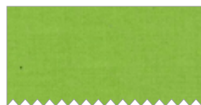
SC5333 Kiwi Fat 1/8