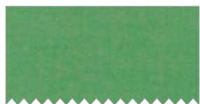
SC5333 Leaf Fat 1/4