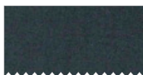
SC5333 Metal 5/8 yard