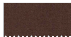
SC5333 Brown Fat 1/8