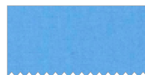
SC5333 Cornflower Fat 1/4