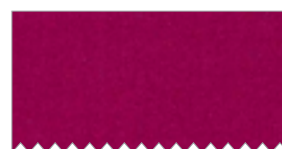
SC5333 Pomegranate Fat 1/8