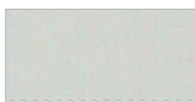
SC5333 Haze Fat 1/4