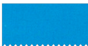
SC5333 Electric Fat 1/8