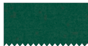
SC5333 Pine Fat 1/8