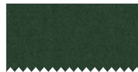
SC5333 Cypress Fat 1/8