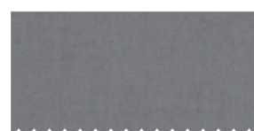
SC5333 Pewter Fat 1/4