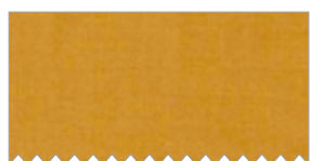
SC5333 Ochre 1/6 yard