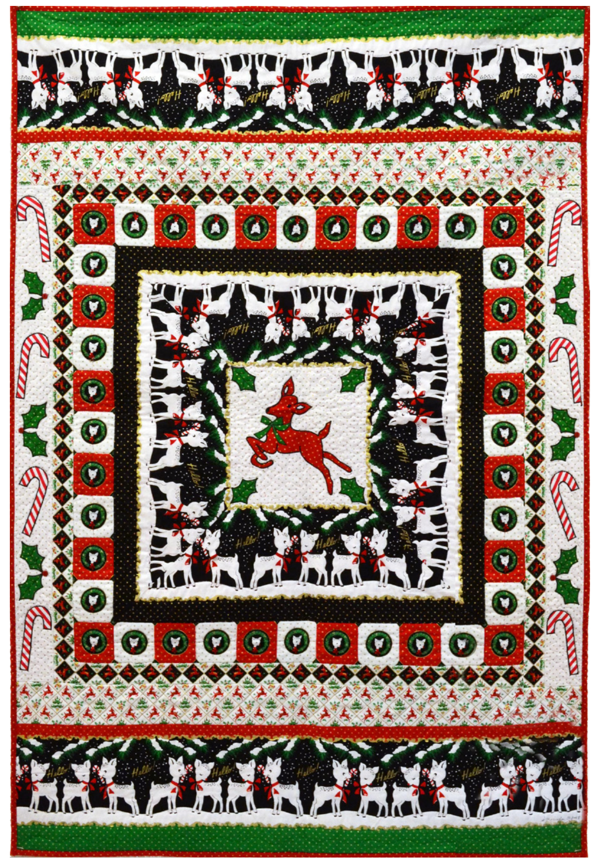
Free Pattern available on michaelmillerfabrics.com