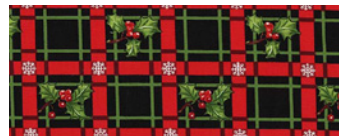
CX8389 Garland Holly Day Plaid 1/6 yard