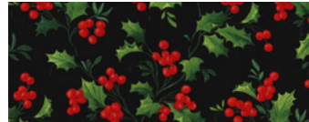
CX4571 Garland Boughs of Holly 1/4 yard