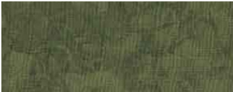
K1156 (Loden) Krystal 5/8 yard