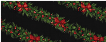
CX8388 Garland Holly Day Garland 1/4 yard