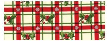
CX8389 Winter Holly Day Plaid 3/8 yard