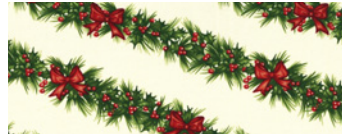
CX8388 Winter Holly Day Garland 1/4 yard