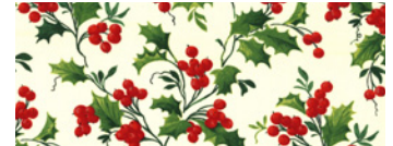
CX4571 Winter Boughs of Holly 5/8 yard