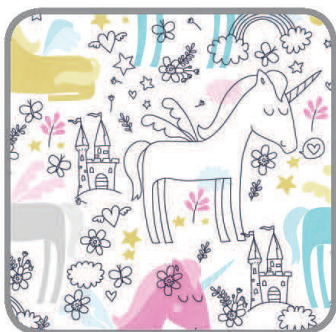
SMZ7667 WHITE UNICORN DOODLEDEE