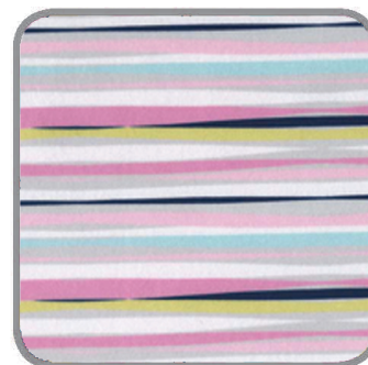
SMZ7669 MULTI UNICORN STRIPE