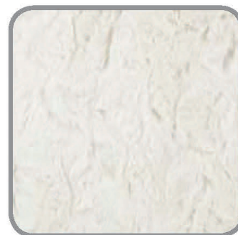
BS7582 CREAM BELLA SNUGGLE