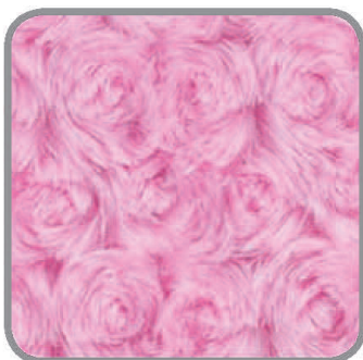
RS7583 BUBBLEGUM ROSEBUD SNUGGLE