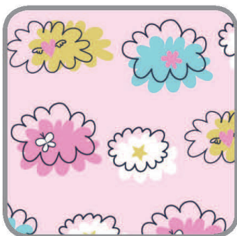
SMZ7668 PINK UNICORN POOF