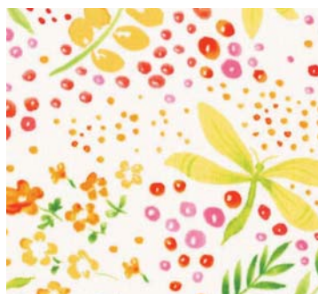
DC7544 Spring ON THE WIND 1/8 yard