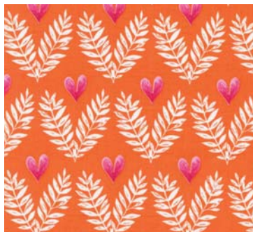
DC7542 Tangerine BIG LOVE 1/8 yard