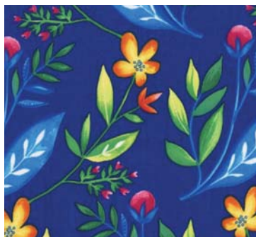
DC7541 Royal MAGGIE JEAN 1/4 yard