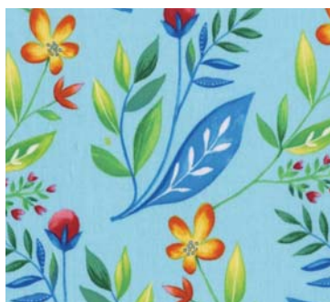
DC7541 Sky MAGGIE JEAN 1/4 yard