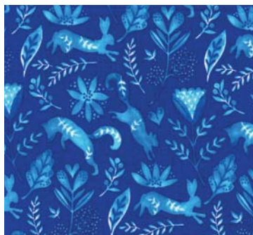
DC7543 Royal FROLICKING 1/4 yard