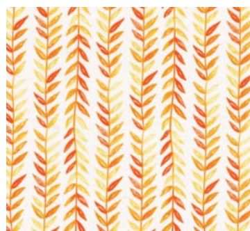
DC7546 Citrus TRESSE 1/8 yard