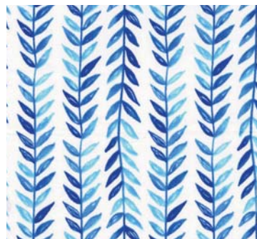
DC7546 Blue TRESSE 1/4 yard