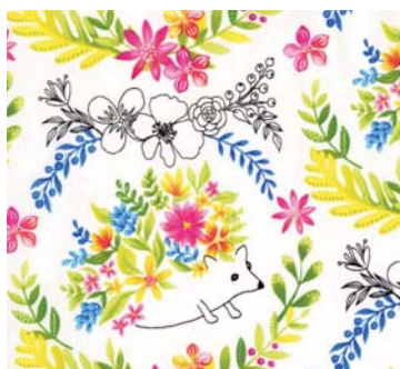
DC7540 Spring SUMMER PORTRAIT 1/8 yard