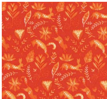
DC7543 Orange FROLICKING 1/8 yard