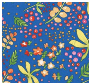
DC7544 Blue ON THE WIND 1/4 yard