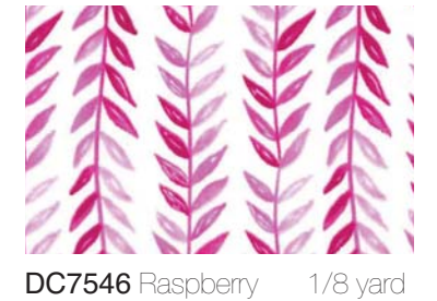
DC7546 Raspberry TRESSE