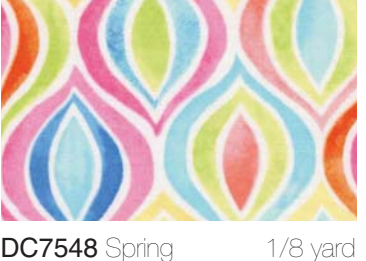
DC7548 Spring MINI BARGELLO