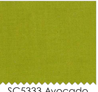
SC5333 Avocado Cotton Couture 3/8 yard