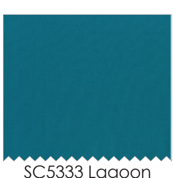
SC5333 Lagoon Cotton Couture 1/6 yard