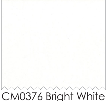
CM0376 Bright White Fairy Frost 3/8 yard