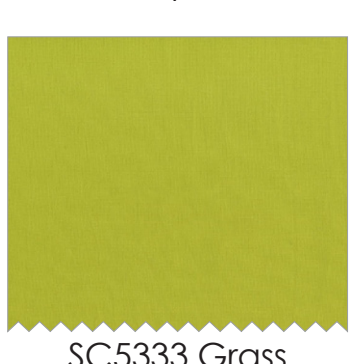
SC5333 Grass Cotton Couture 3/8 yard