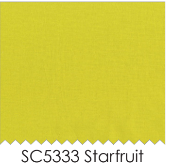
SC5333 Starfruit Cotton Couture 1/6 yard