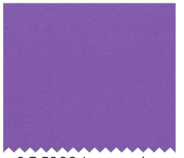
SC5333 Lavendar Cotton Couture 1/6 yard