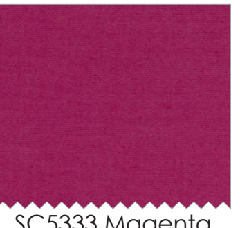
SC5333 Magenta Cotton Couture 1/6 yard