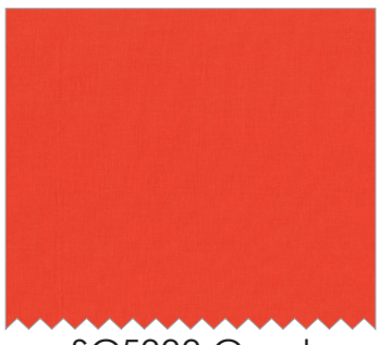
SC5333 Coral Cotton Couture 1/6 yard