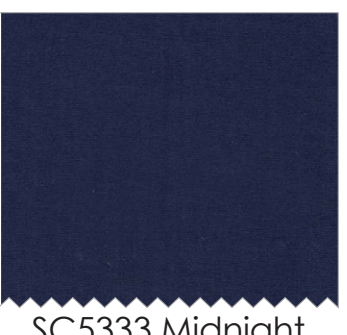
SC5333 Midnight Cotton Couture 1/2 yard