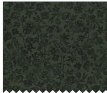
CX7280 Hunter Delicata 1/8 yard