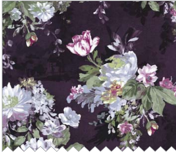
CX7270 Aubergine Serafina 3/4 yard