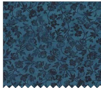
CX7280 Turquoise Delicata 1/8 yard