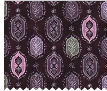
CX7278 Aubergine Angelina 5/8 yard