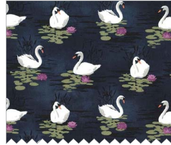
CX7284 Midnite Odette 1/4 yard