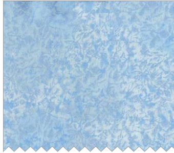
CM0376 Powder Blue Fairy Frost 1 yard