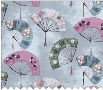
CX7279 Gray Fancy 1/4 yard