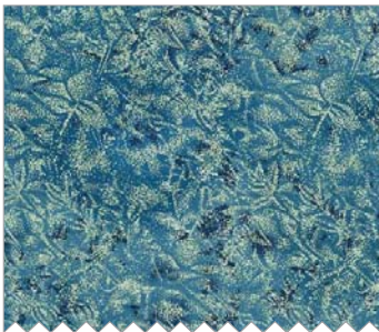
CM0376 Cabana Fairy Frost 5/8 yard