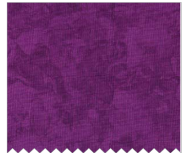
K1274 (Magenta) Krystal 1/8 yard