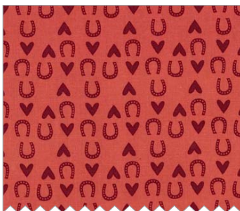
CX7236 Red Lucky Horseshoe 1 yard