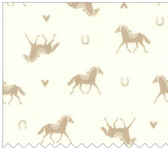
CX7238 Cream Hot to Trot 1 yard