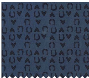
CX7236 Denim Lucky Horseshoe 1/2 yard