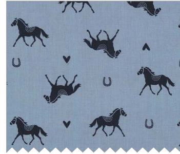
CX7238 Denim Hot to Trot 3/4 yard