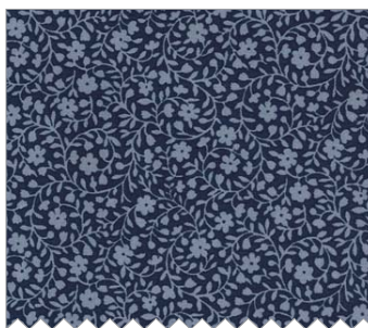
CX4594 Denim Bud Loop 3/4 yard for binding