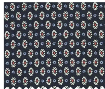
CX7235 Denim Cash 1/2 yard