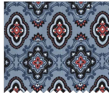
CX7237 Denim Waylon 1/4 yard