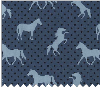
CX7239 Denim Pony Up 3/4 yard