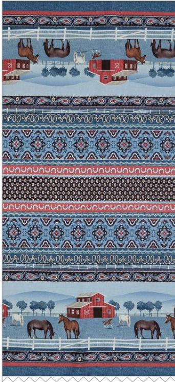
CX7233 Denim Outstanding in their Field 1 yard if you fussy cut