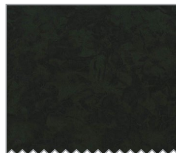
K2259 (Dark Green) Krystal 3/4 yard