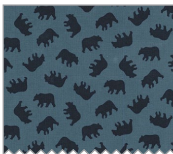
CX7244 Lagoon Little Bears 1/4 yard