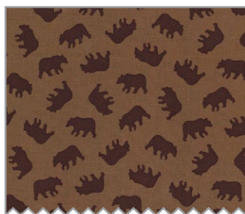
CX7244 Brown Little Bears Fat 1/8