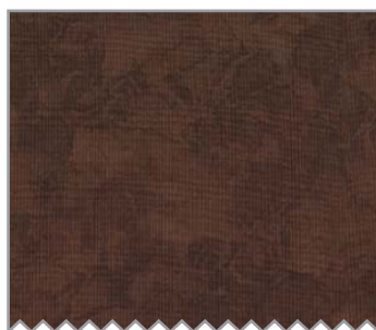
K2214 (Brown) Krystal 1/8 yard