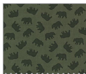
CX7244 Olive Little Bears 1/4 yard