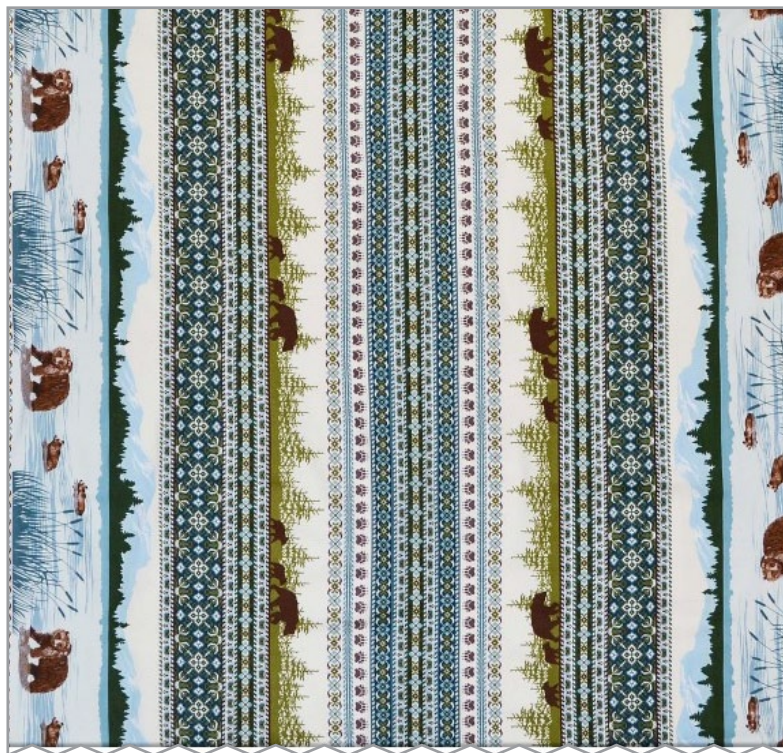
CX7232 Forest Bear Lake 1 1/4 yards