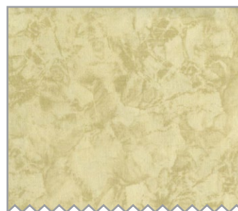
K1007 (Parchment) Krystal 1/4 yard