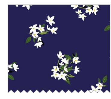
CX7144 Sapphire Lily of the Valley 3/4 yard