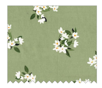
CX7144 Leaf Lily of the Valley 5/8 yard