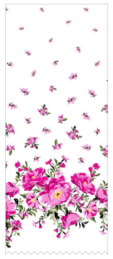
CX7141 Rose Cabbage Rose Border 3/4 yard