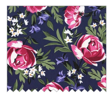
CX7143 Sapphire Bed of Roses 3/8 yard