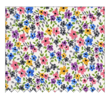
CX6886 White Forget Me Not 1/4 yard