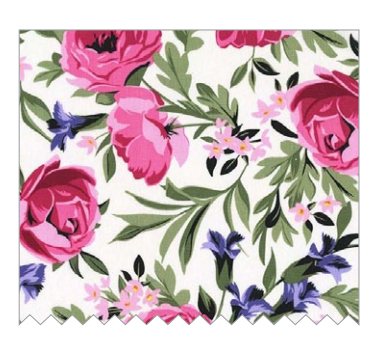
CX7143 Rose Bed of Roses 1/4 yard