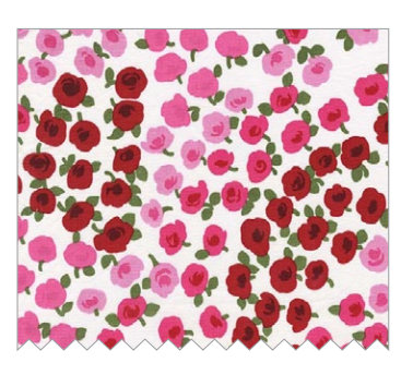
CX6899 Red Ava 3/8 yard