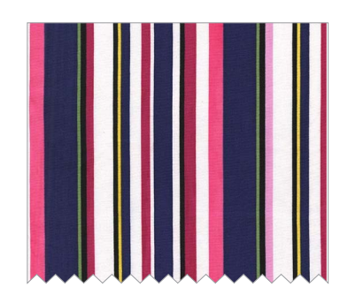
CX7146 Sapphire Briar Path 1/4 yard