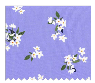
CX7144 Opal Lily of the Valley 5/8 yard