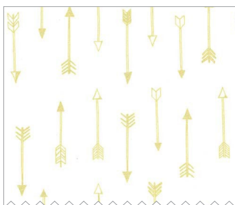
MC6990 Bright White