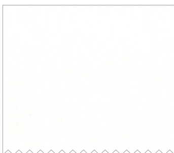
SC5333 Bright White