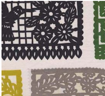
DC6840 CITRON PUEBLA 1/2 yard