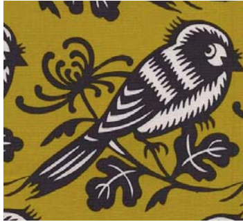
DC6838 CITRON CHIRP 1/2 yard