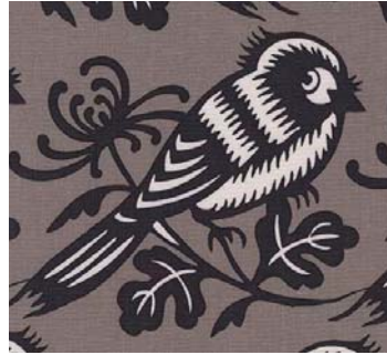
DC6838 PEWTER CHIRP 1/2 yard