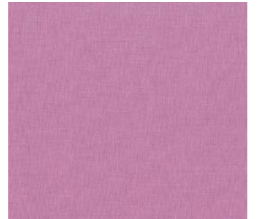
SC5333 MAUVE COTTON COUTURE 1/8 yard