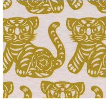
DC6839 CITRON GROWL 1/2 yard