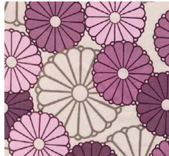
DC6845 PLUM PARASOLS BACKING FABRIC: 2 yards