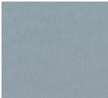
SC5333 FOG COTTON COUTURE 1/8 yard