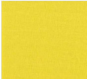
SC5333 STRAW COTTON COUTURE 1/8 yard