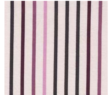
DC6849 PLUM PAVILLION STRIPE BINDING 1/2 yard