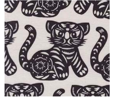
DC6839 GRAPHITE GROWL 1/2 yard