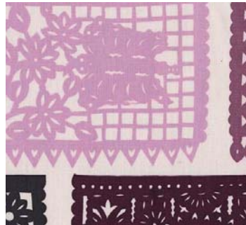
DC6840 PLUM PUEBLA 1 yard