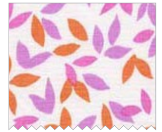
DC6870 Orchid Little Leaves 1/6 yard