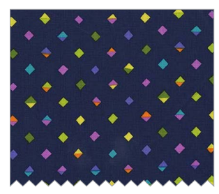
DC6871 Navy Split Diamonds 3/8 yard