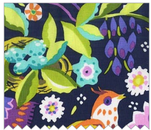
DC6863 Navy Folk Birds 1 yard