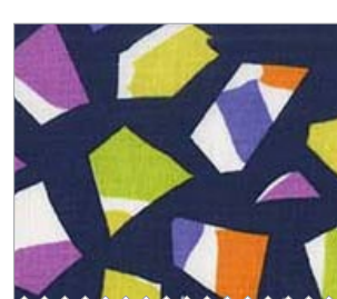
DC6865 Navy Fragments 1/6 yard