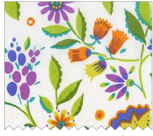
DC6864 Jewel Folk Floral 1/6 yard