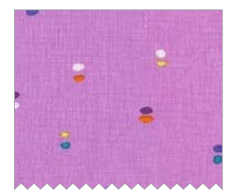
DC6866 Orchid Double Dot 1/6 yard