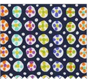
DC6872 Navy Button Spot 1/6 yard