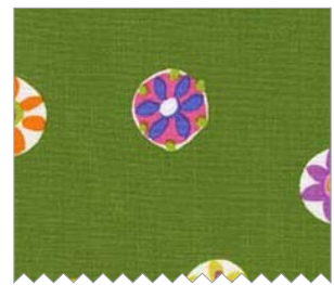
DC6867 Avocado Folk Floral Dot 1/8 yard