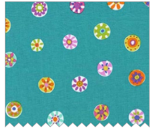
DC6867 Mermaid Folk Floral Dot 1/8 yard