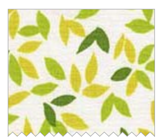
DC6870 Starfruit Little Leaves 1/6 yard