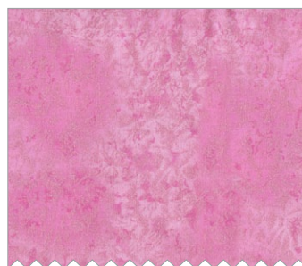
CM0376 Pink Fairy Frost Fat 1/8