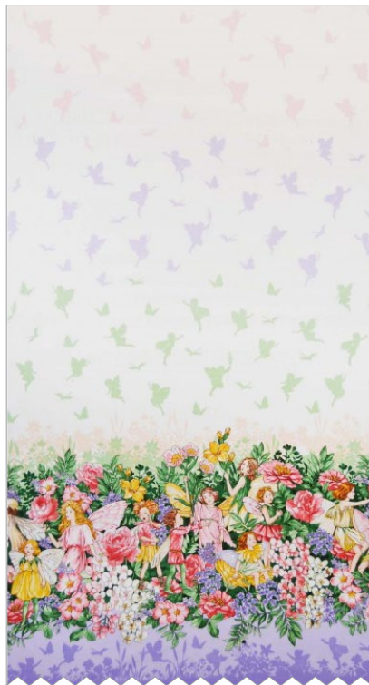
DM6797 Blossom Fairy Dream Border 1/2 yard