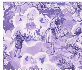
DM6799 Lilac Fairy Dream Land 3/8 yard