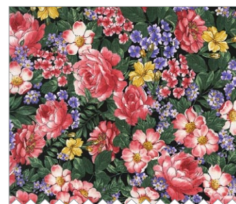
DC6798 Bloom Fairy Dream Flowers 1/8 yard