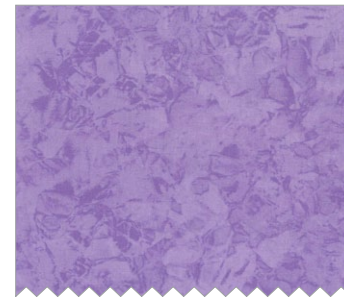
K1075 (Lavender) Krystal 1/8 yard