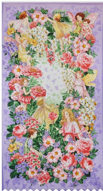
DC6796 Blossom Fairy Dream Panel 2/3 yard