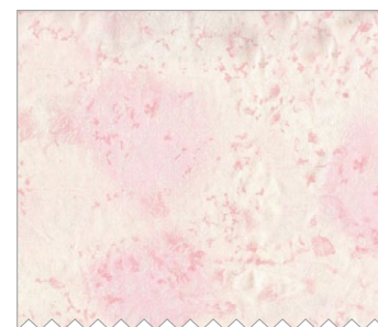
CM0376 Cameo Fairy Frost Fat 1/8