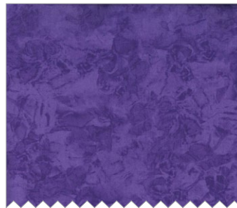
K1175 (Purple) Krystal 5/8 yard