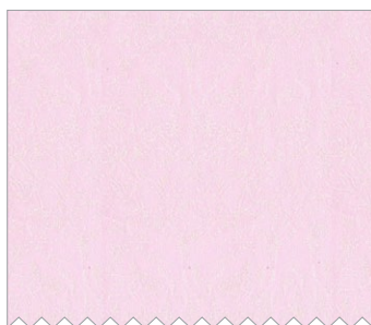
CM0376 Dusty Rose Fairy Frost Fat 1/8