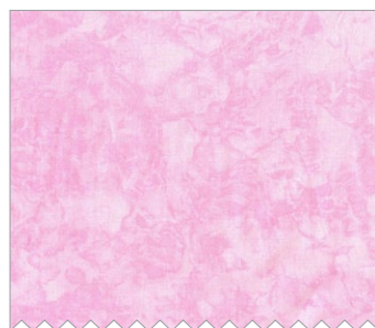
K4031 (Pink) Krystal Fat 1/8