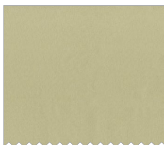
Khaki Half Yard