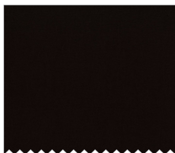
Chocolate Fat 1/4