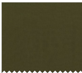
Herb Fat 1/4