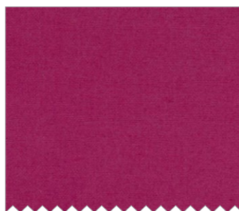
Magenta Fat 1/4