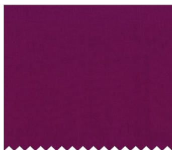
Jewel Half Yard