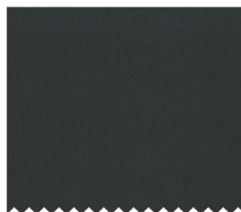
Gray Fat 1/4