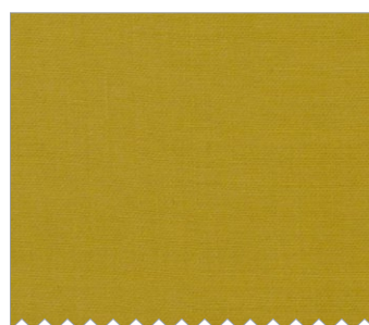
Gold Half Yard