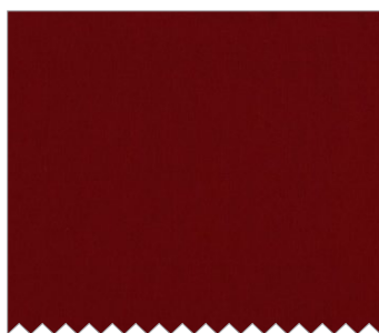
Brick Fat 1/4