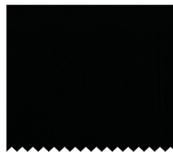
Black Fat 1/4