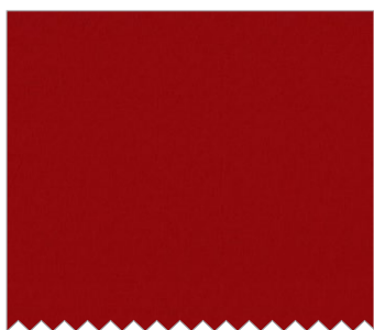
Cranberry Fat 1/4