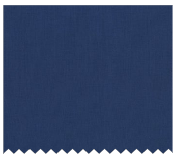
Denim Fat 1/4