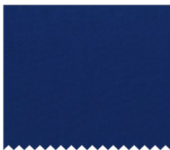
Nite Fat 1/4