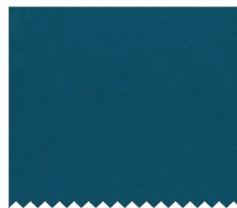
Marine Fat 1/4