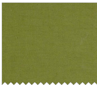
Olive Fat 1/4