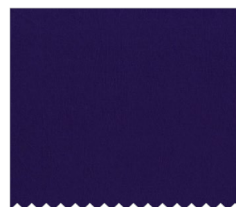
Amethyst Fat 1/4