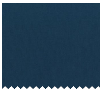
Teal Fat 1/4