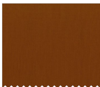
Cinammon Fat 1/4