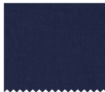
Midnight Half Yard