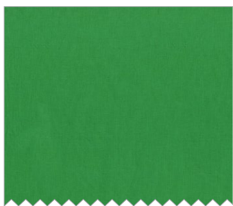
Turf Fat 1/4