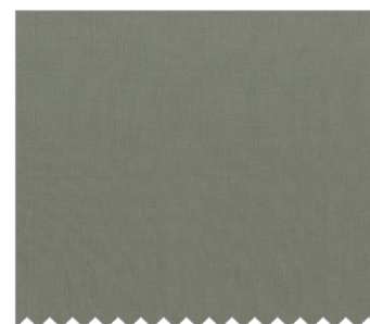
Stone Fat 1/4