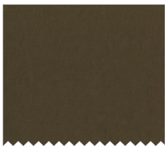
Taupe Fat 1/4