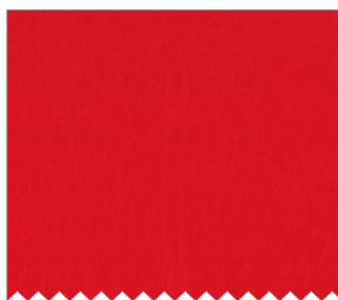
Watermelon Fat 1/4