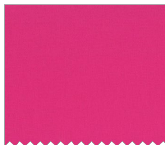
Raspberry Fat 1/4