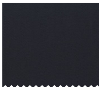
Charcoal Half Yard