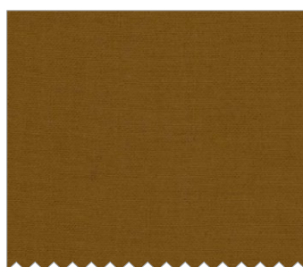
Amber Fat 1/4