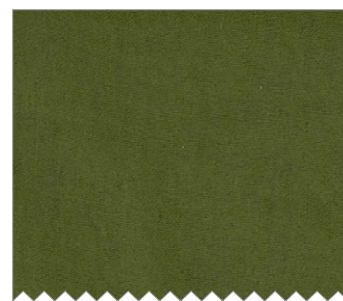
Loden Half Yard