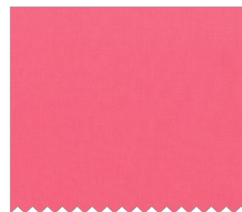
Petal Half Yard