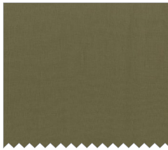
Dirt Fat 1/4