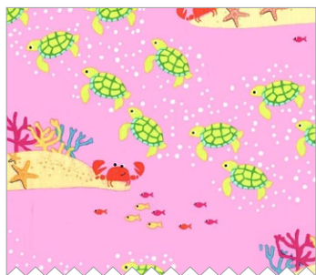
PC6224 Pink Meetin' at the Reef 1/2 yard