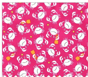
PC6618 Raspberry Little Diggers Fat 1/4