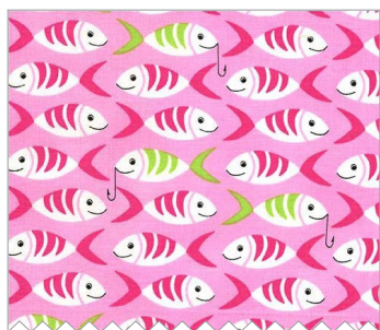
PC6617 Pink Little Fishies 1/4 yard