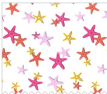
PC6620 Coral A Sea of Stars 3/8 yard