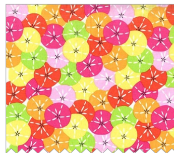
PC6619 Citrus Dozens of Dollars 1/4 yard