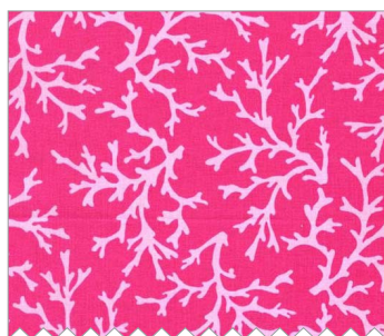
PC6622 Raspberry Sea Coral Fat 1/4