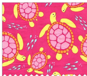
PC6616 Magenta Swimmin' in the Sea Fat 1/4