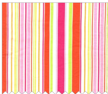
PC6621 Pink Umbrella Stripe 5/8 yard