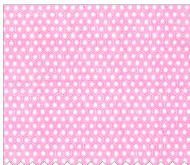
DC6512 Pink Sun Tiles 5/8 yard