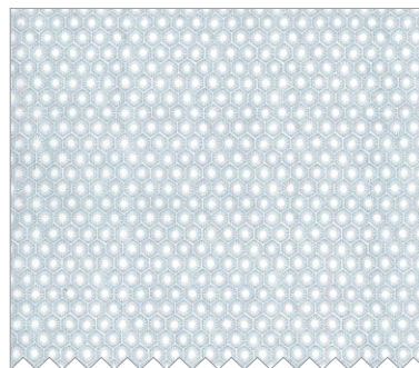
DC6512 Fog Sun Tiles 5/8 yard