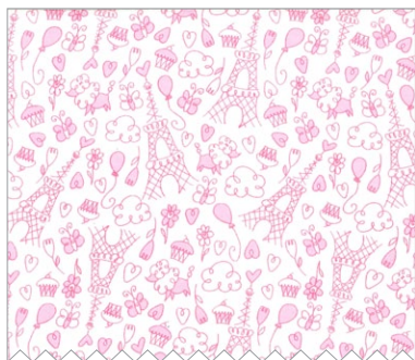
CX6554 Pink Petite Paris 3/8 yard