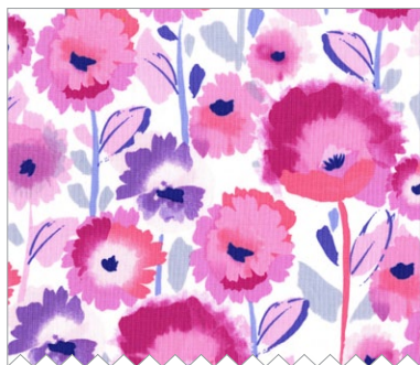
PC6582 Bloom Josephine 3/4 yard