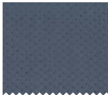
Clipdot Gray 3" x 12" piece