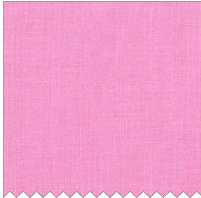
SC5333 Pink Cotton Couture 1 yard