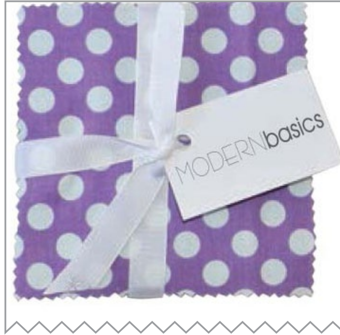
Charm035 Bloom Charm Pack (2) 45 piece packages