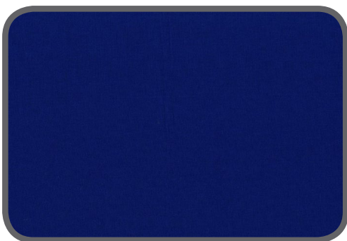
SC5333 Royal Cotton Couture 3/4 yard