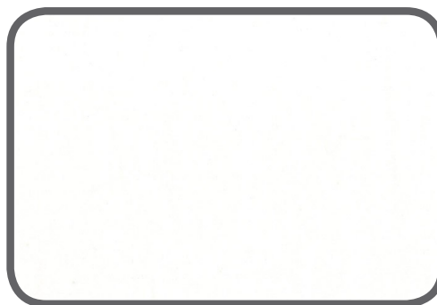
SC5333 Bright White Cotton Couture 3/4 yard