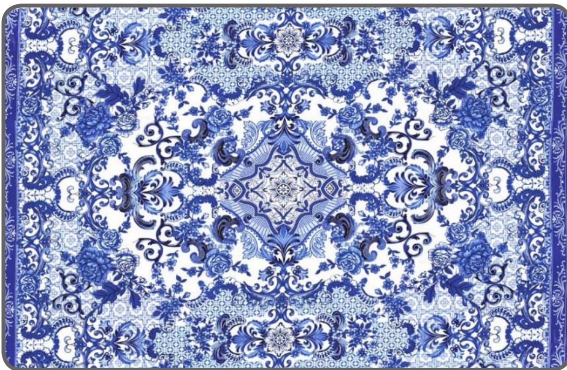
CX5998 Azure Blue and White Porcelain 2 yards