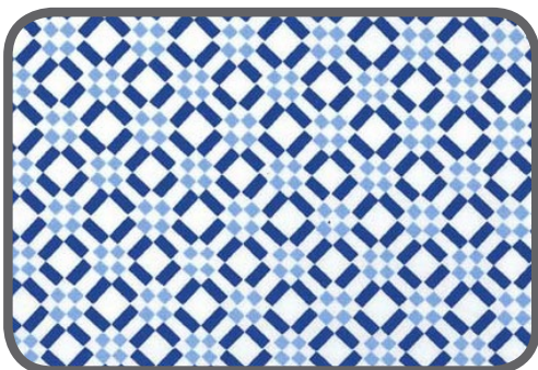
CX6319 Azure Porcelain Check 3/4 yard