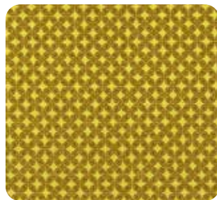
CX5988 Topaz Tiny Tiles 1/8 yard