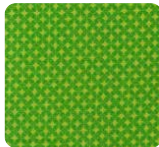
CX5988 Apple Tiny Tiles 1/8 yard