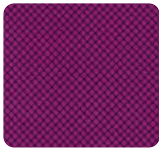
CX5911 Jewel Cora 1/8 yard