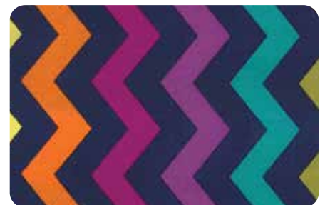
PC5709 Midnite Chic Chevron 7/8 yard