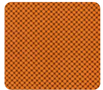
CX5911 Apricot Cora 1/8 yard