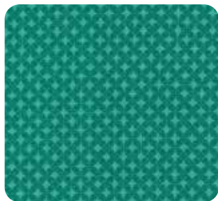
CX5988 Teal Tiny Tiles 1/8 yard