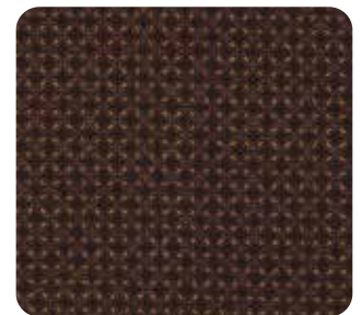
CX5988 Espresso Tiny Tiles 1/8 yard