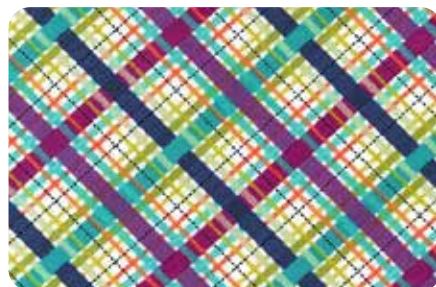
CX5877 Jewel Lil' Bias Plaid 3/8 yard