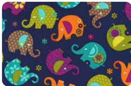
CX5979 Midnite Elephant Romp 1/2 yard