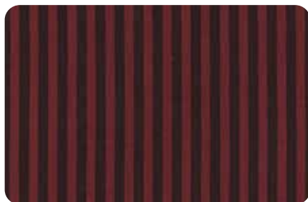
CX3584 Earth Clown Stripe 3/8 yard