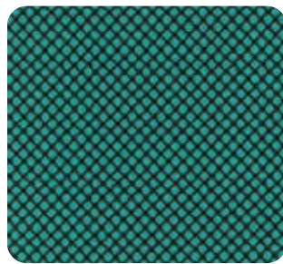
CX5911 Teal Cora 1/8 yard