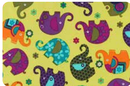
CX5979 Starfruit Elephant Romp 1/2 yard