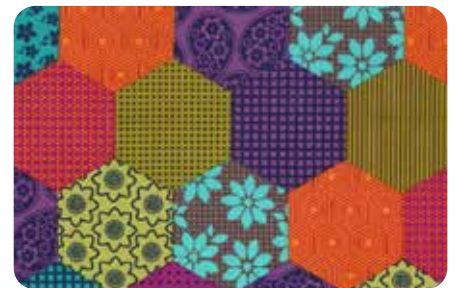
CX6016 Jewel Patchwork Too 5/8 yard