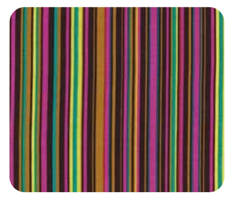
CX3137 Forest Play Stripe 5/8 yard