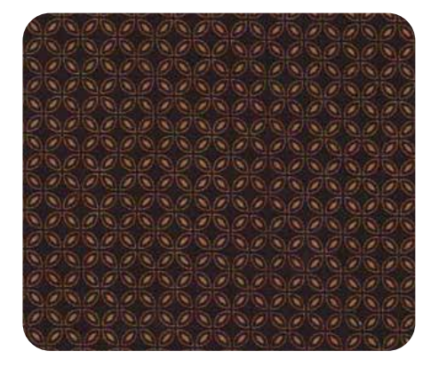
CX5988 Espresso Tiny Tiles 3/8 yard