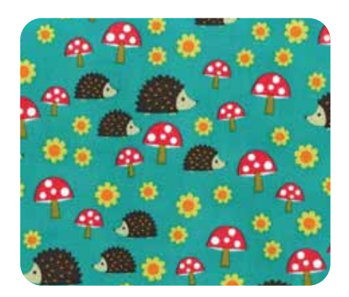
CX5994 Teal Hedgehoglets 1/6 yard