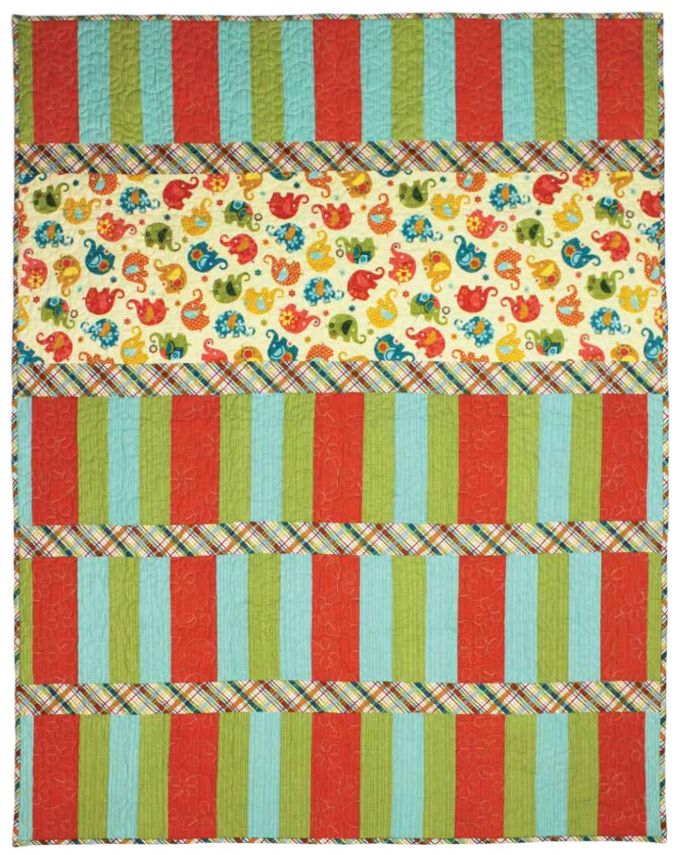
Size: 40.5" W x 52.5" H | Quilt designed by Ellen Maxwell