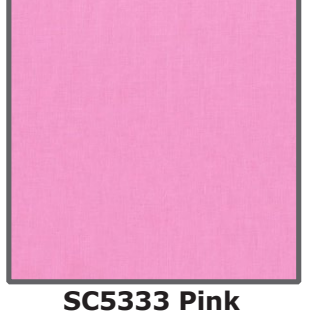
Cotton Couture 12" square each