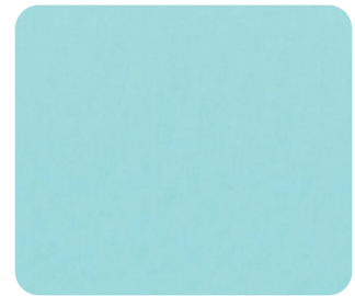
SC5333 Aqua Cotton Couture 1/2 yard