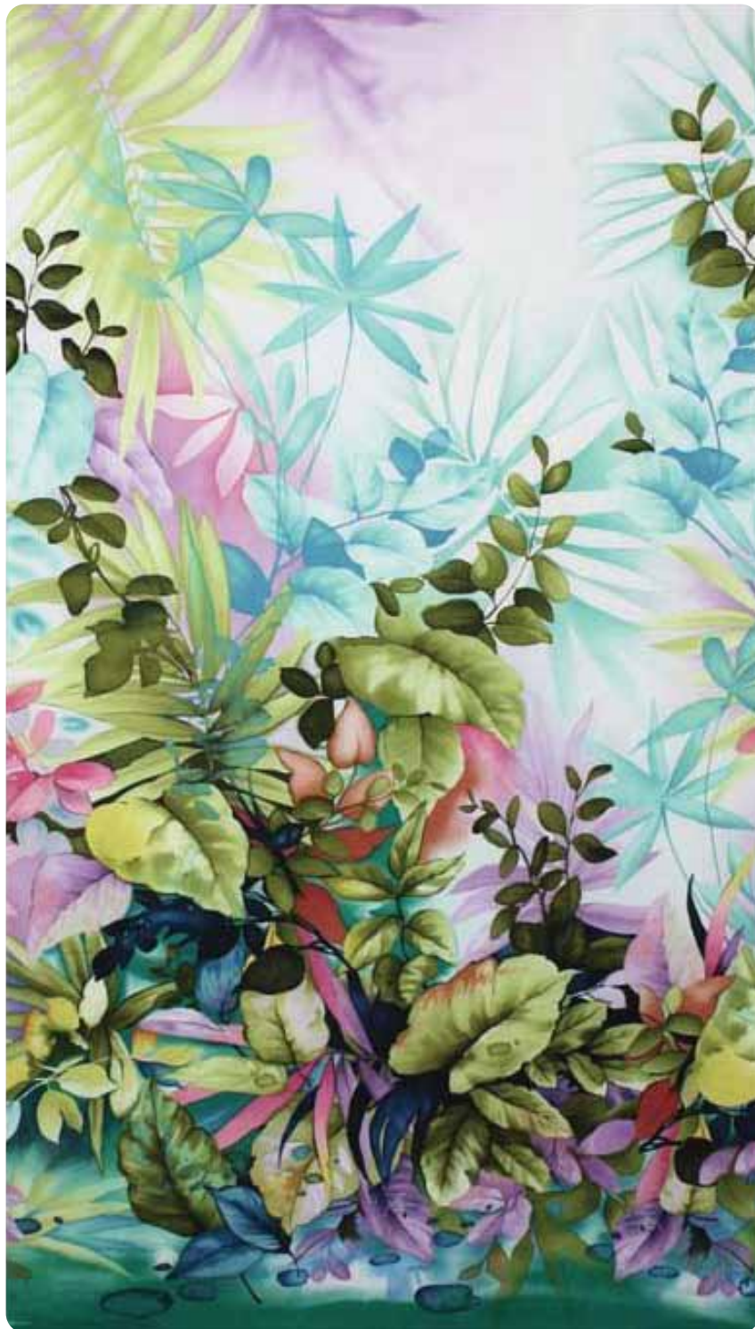
PC6118 Multi Paradise Island (2) complete panels - approximately 1-3/8 yards